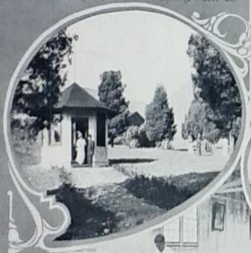
Office and Bottling Works of the Veronica Medicinal Springs Water Co.