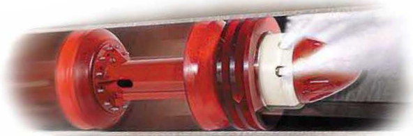
Corrosion Inhibitor Pig