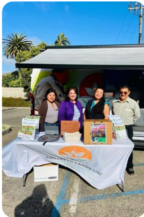
Fresh Venture Foods