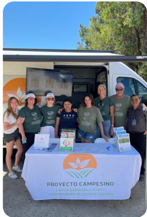
Santa Barbara Vintners Foundation