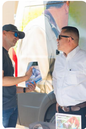
Reiter Affiliated Companies