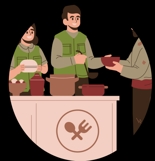
HUMAN SERVICES COMMISSION (HSC)