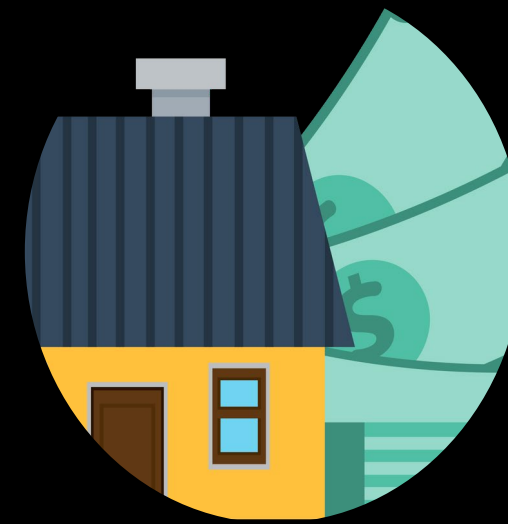
PERMANENT LOCAL HOUSING ALLOCATION (PLHA)