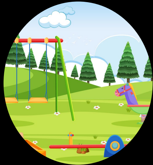
COMMUNITY DEVELOPMENT BLOCK GRANT (CDBG)