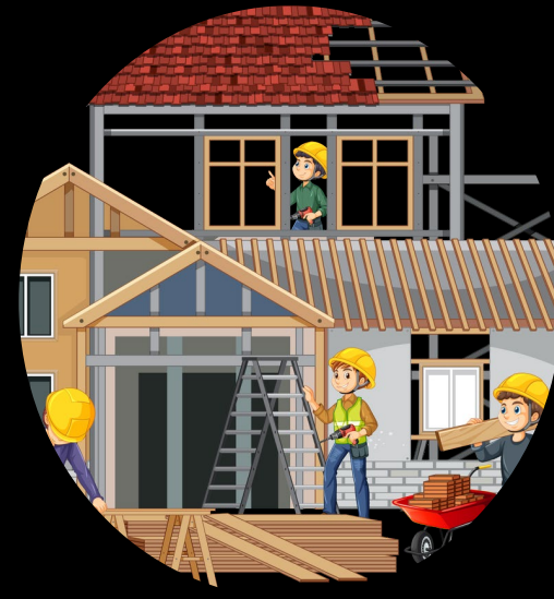
HOME INVESTMENT PARTNERSHIPS (HOME)