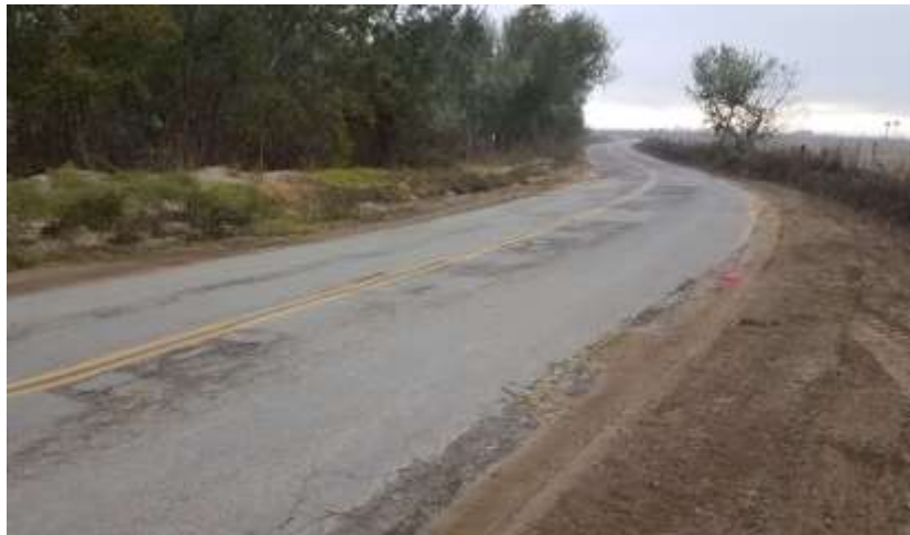
Before -West Main Street looking east

The project removed failed asphalt and raised the roadway profile to allow better drainage. This project reestablished the width of the road to two ten-foot lanes, and raised the roadway elevation 2 to 3 feet.