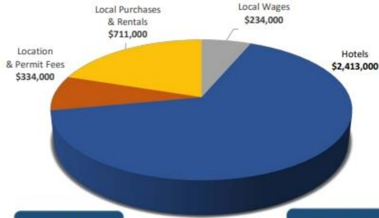
Big Little Lies (Season 2) Local Spend in Monterey County: $3,692,000

The California Film Commission works with our local film offices to attract and assist film, television and commercial productions across the state. Media productions create jobs and provide economic impact to local communities. This regional report summarizes the economic benefit to Monterey County from season 2 of the HBO series Big Little Lies . In 2018 - 2019, this drama series contributed more than $3.6 million to Monterey County's economy.