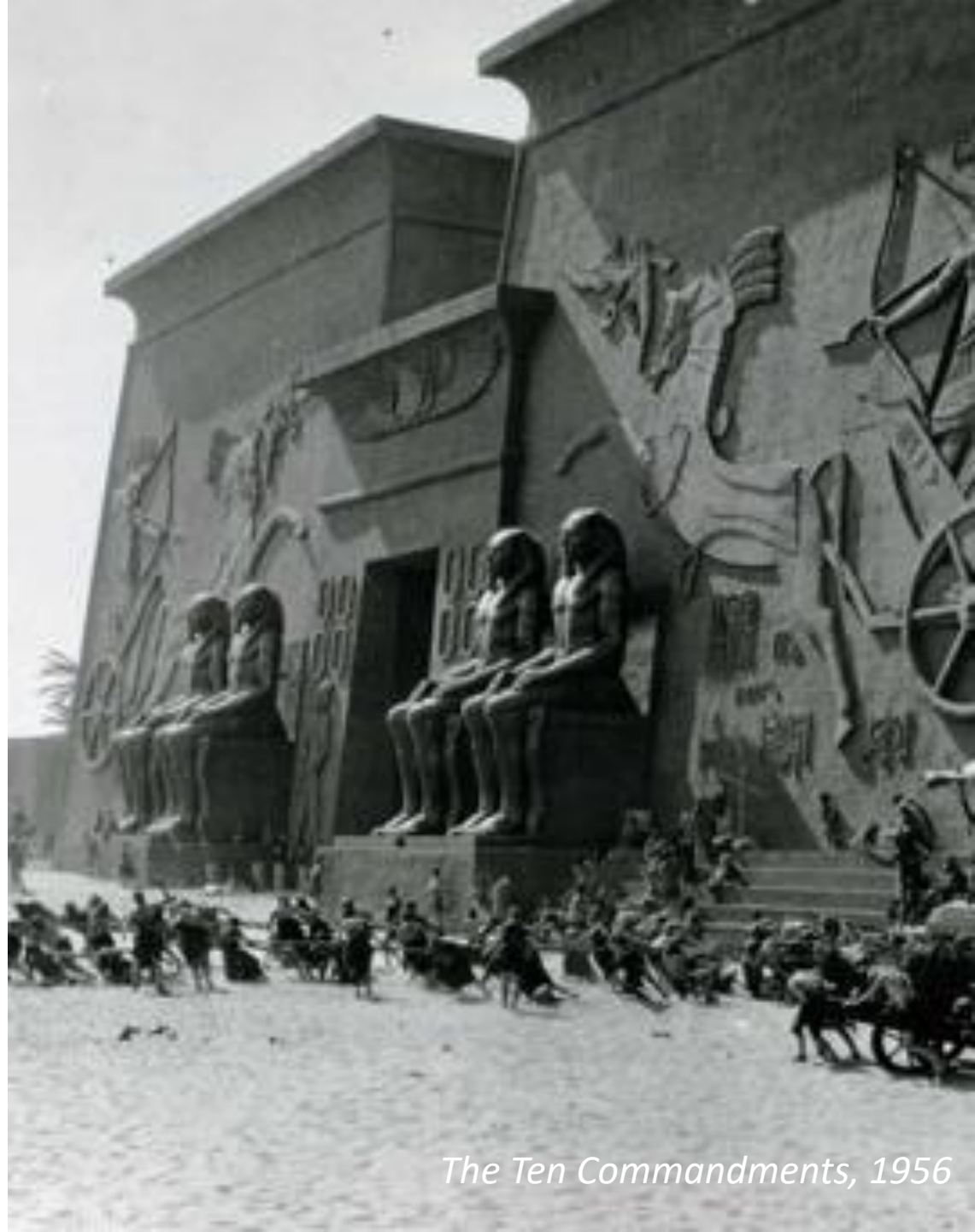
The Ten Commandments, 1956