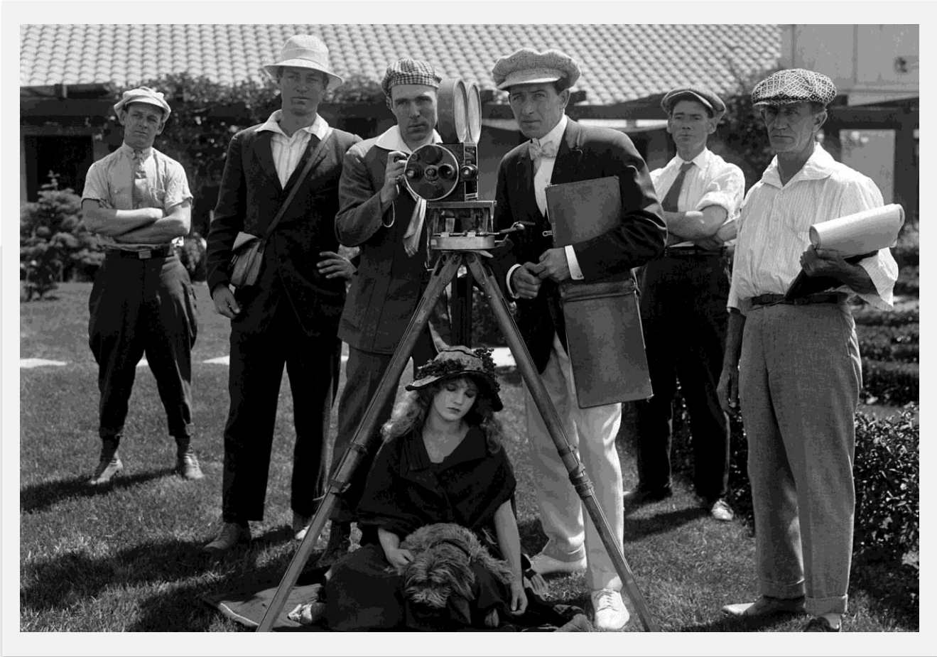
A little history of film in Santa Barbara County