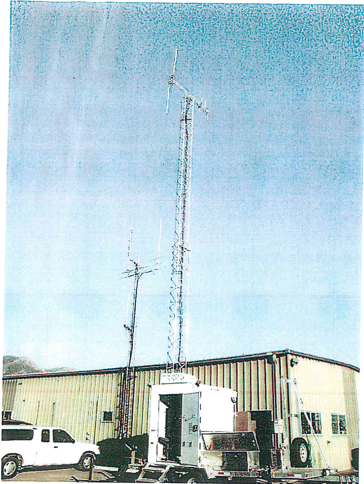
EXHIBIT A THE TRAILER AND EQUIPMENT