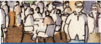
Figure 3.4 Spatial Standards - South Side of Pardall Road and the Embarcadero Loop