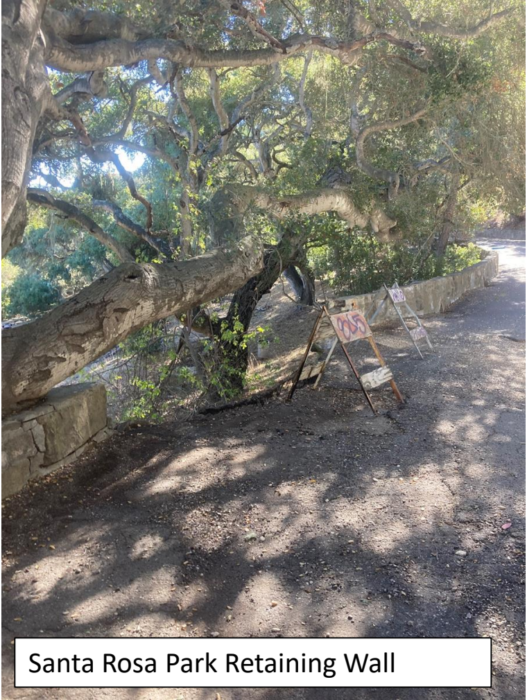
Santa Rosa Park Retaining Wall