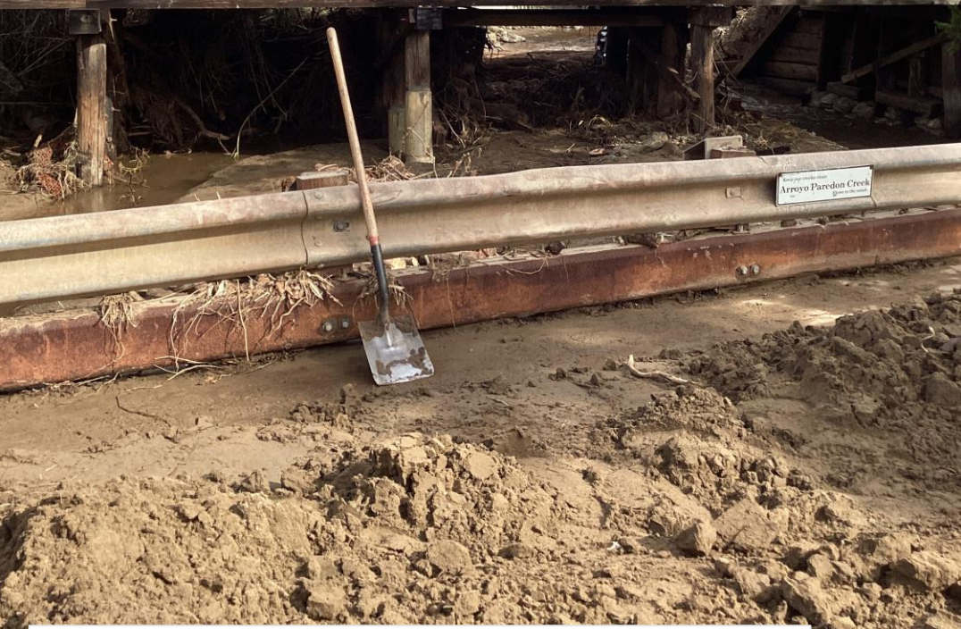
Br. 51C-206 Replacement – Padaro Ln