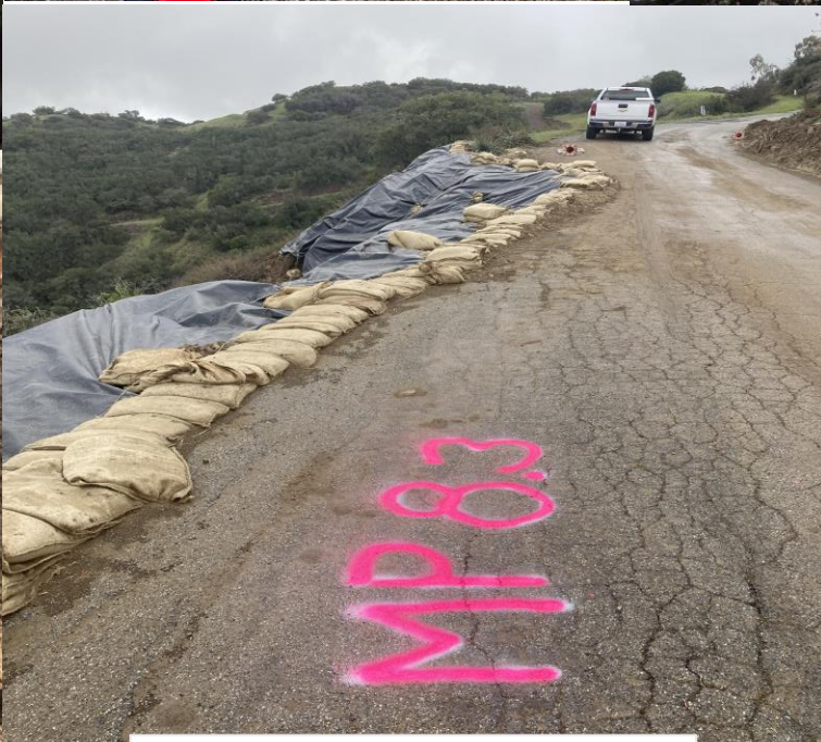
E Camino Cielo – MP 8.3