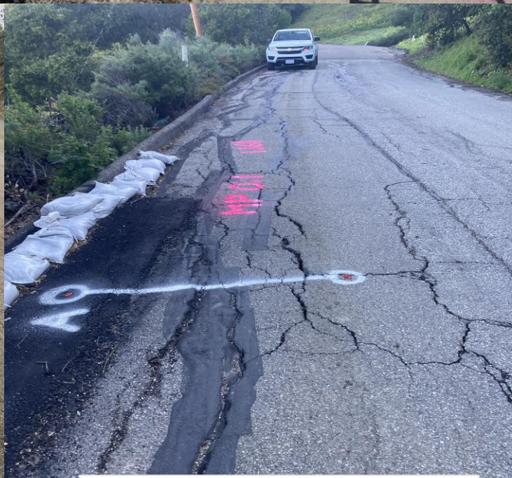
Palomino Rd - Road Failure