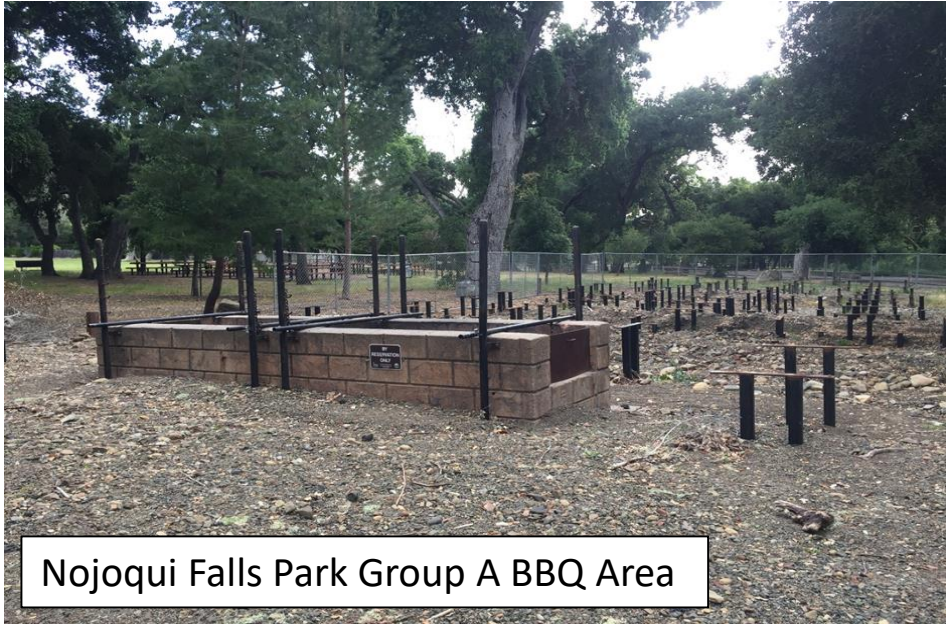
Nojoqui Falls Park Group A BBQ Area