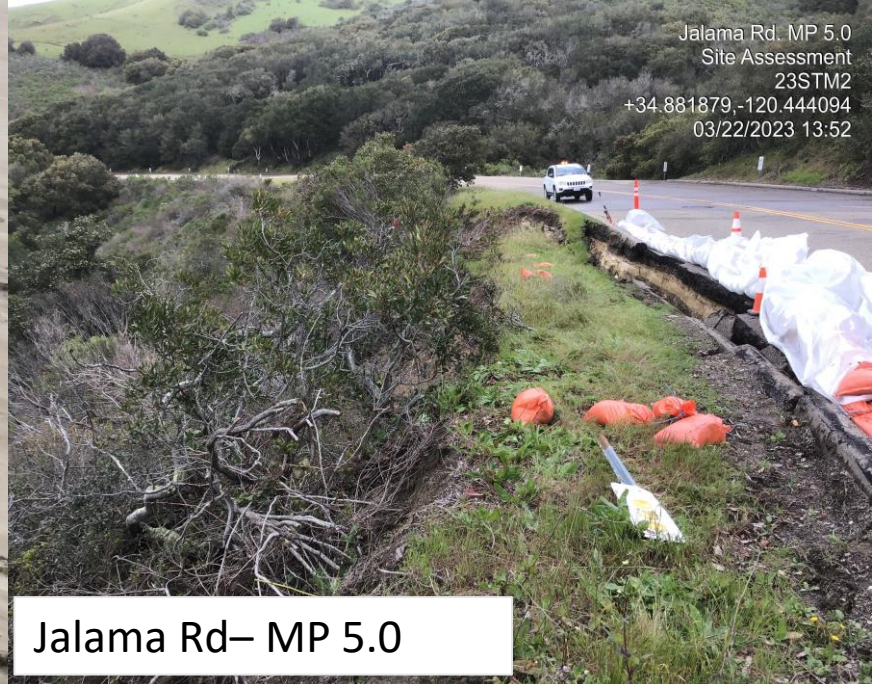
Jalama Rd- MP 5.0

Jalama Rd. MP 5.0 Site Assessment 23STM2 +34.881879,-120.444094 03/22/2023 13:52