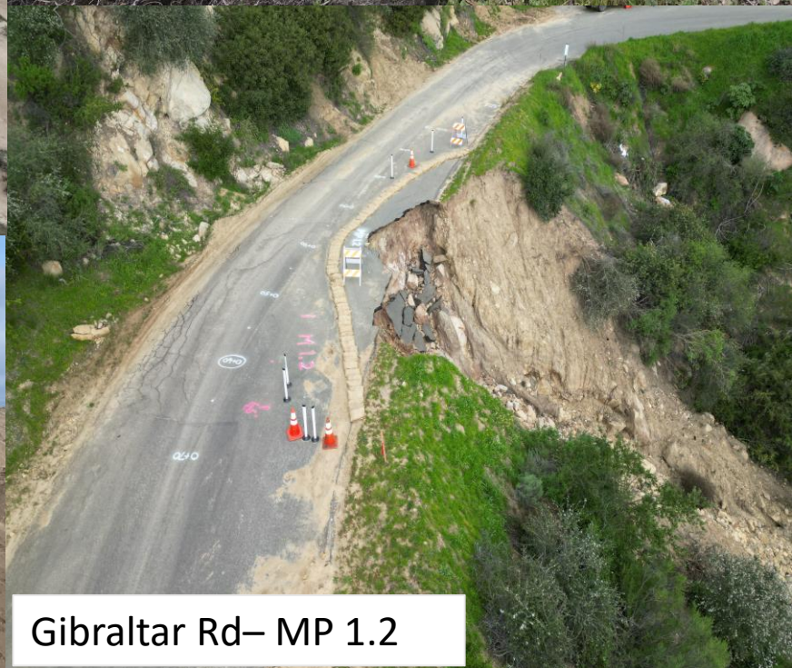
Gibraltar Rd- MP 1.2