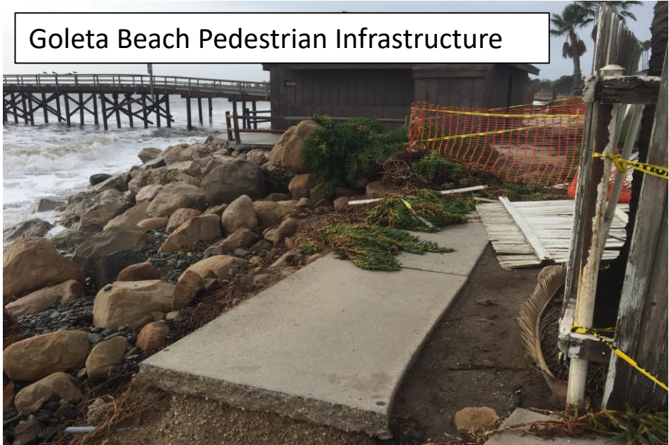
Goleta Beach Pedestrian Infrastructure