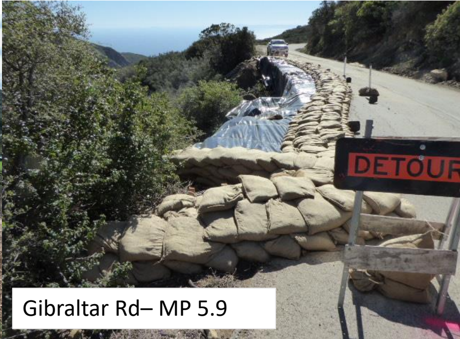
Gibraltar Rd– MP 5.9