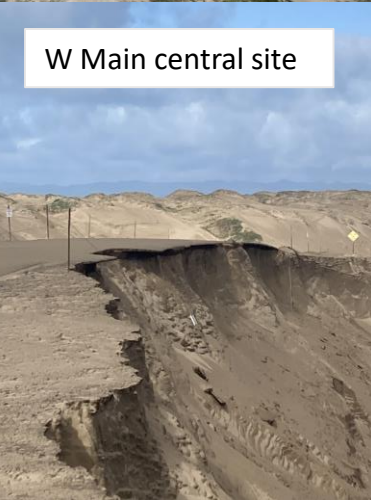
W Main central site