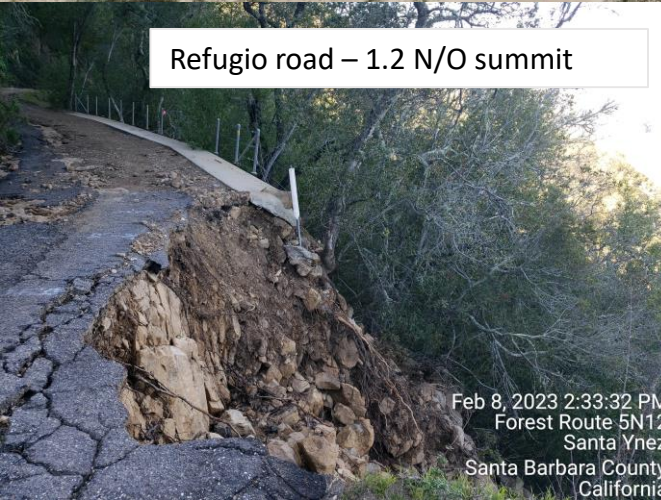
Refugio road - 1.2 N/O summit

Feb 8, 2023 2:33:32 PM Forest Route 5N12 Santa Ynez Santa Barbara County California