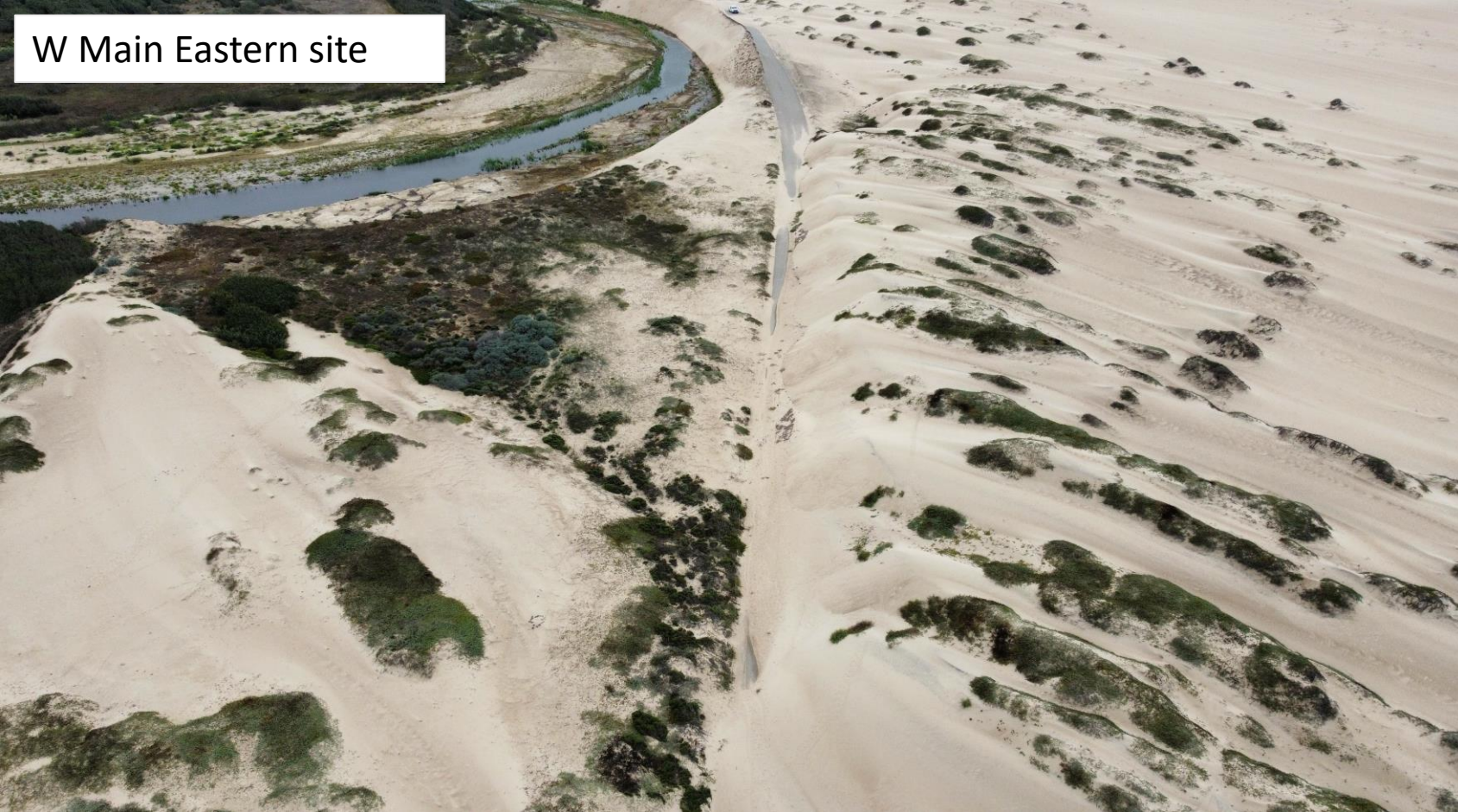
W Main Eastern site

Jalama Rd. MP 5.0 Site Assessment 23STM2 +34.881879,-120.444094 03/22/2023 13:52