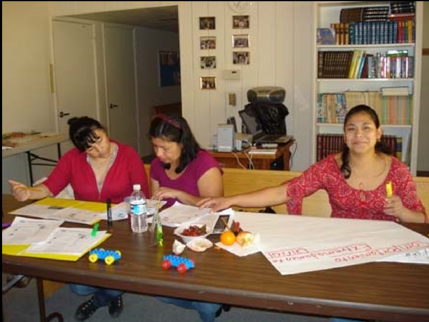
Changing Lives in Cuyama