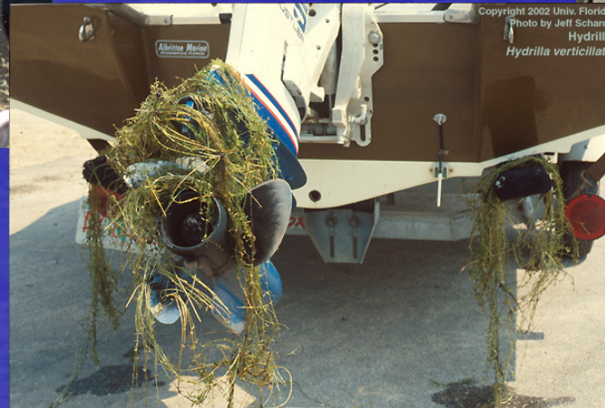
Hydrilla Hydrilla verticillata