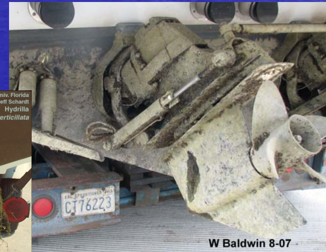
W Baldwin 8-07