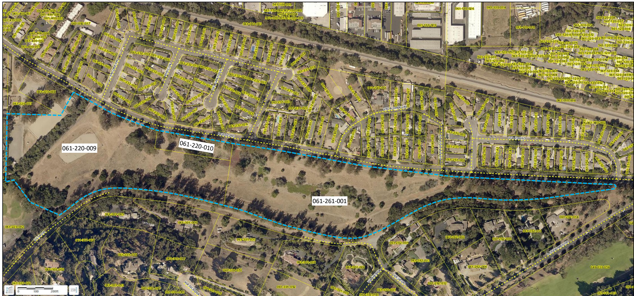
Exhibit 1: Project Property