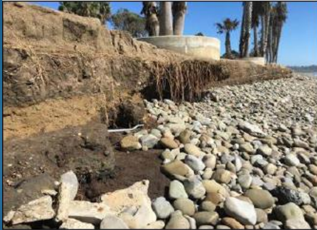
Surfer's Point - 2016 Ventura