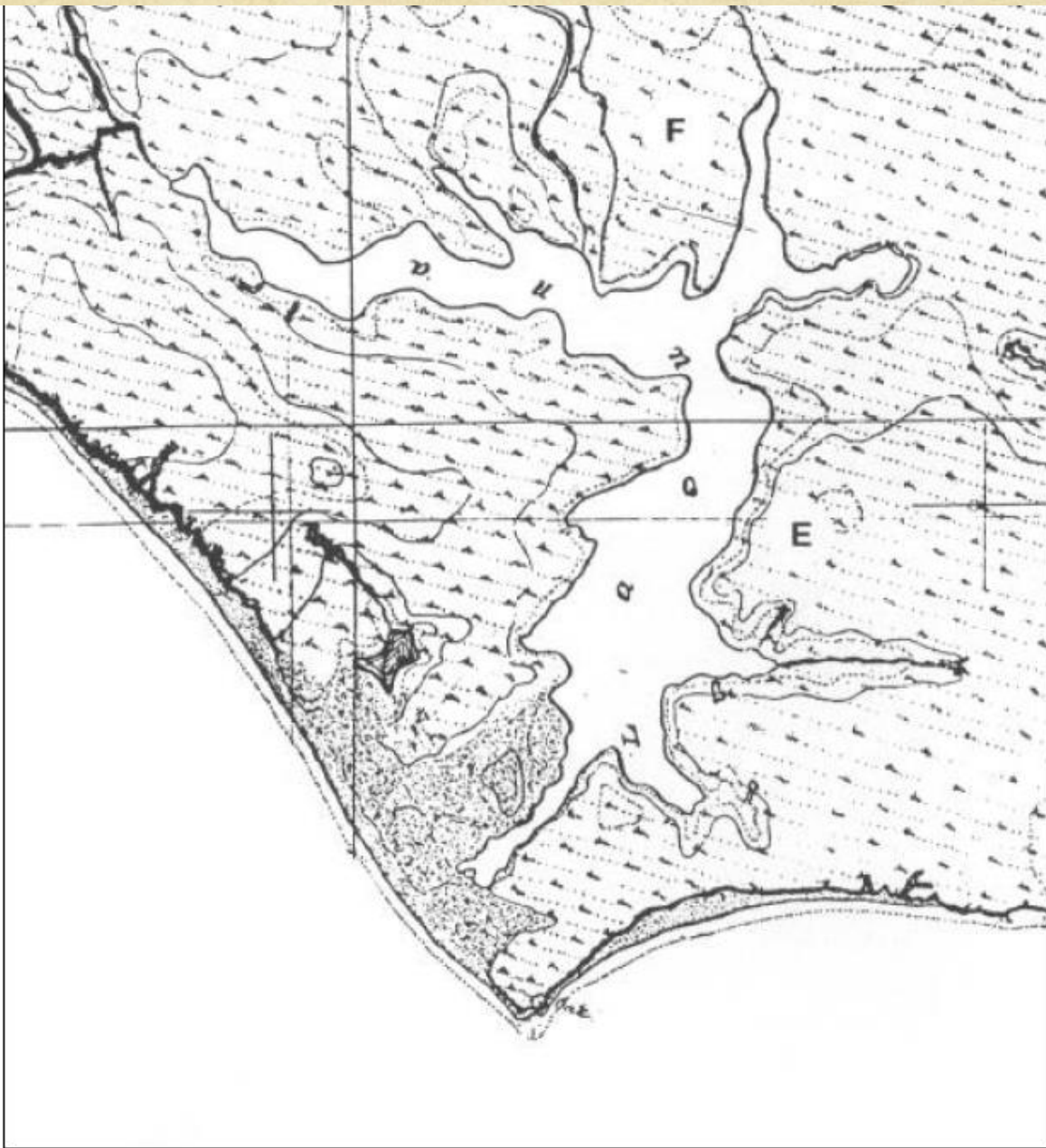
Figure A-2 U.S. Coastal Survey Map, 1871/73. Adapted from Ferren and Thomas 1995.