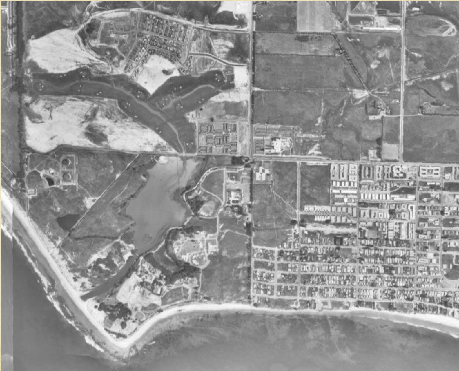
1967: Large scale soil movement for golf course