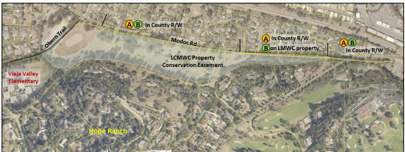
Figure 2: Alignments A and B

Two alignments were studied in preliminary design and environmental stages, Alignment A and B. Both along the south side of Modoc Road and roughly parallel with the roadway. The alignments were identical for much of the corridor. In the middle section (Figure 2) Alignment B separates from the roadway by roughly 10 feet meandering outside the County right of way and into the Modoc Preserve for approximately 1,600 feet, running between Vista Clara on the West, and Via Zorro on the east, then it continues east through the County right of way, ending at the intersection of Modoc Road and Via Senda.