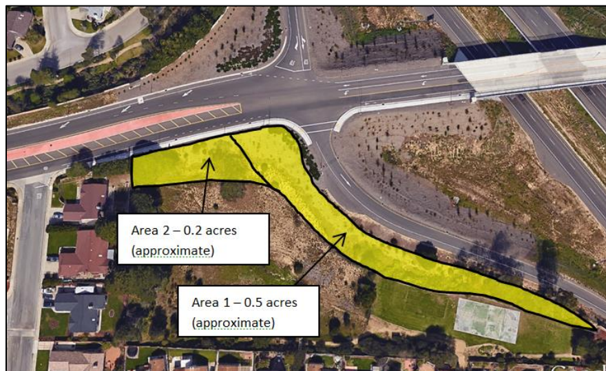
Figure 1 Approximate limits of excess land

Woodmere wall (see Exhibit A-2 for location):