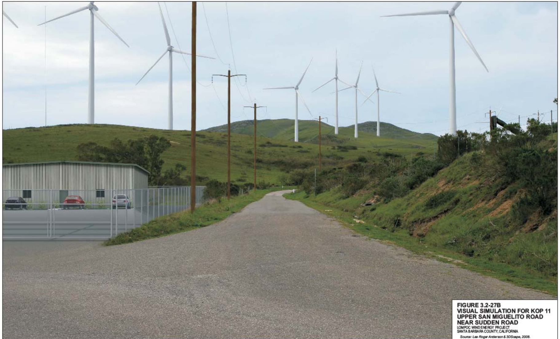
Sudden Road & San Miguelito Road