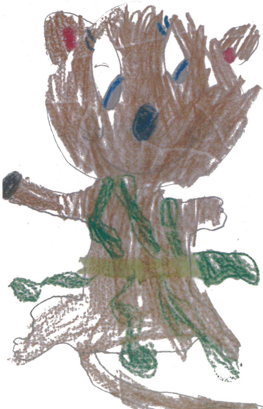
"Sea Otter" Art by Duncan Hunt

Our family strongly recommends that the Santa Barbara Board of Supervisors use the Coastal Resource Enhancement Fund to support the construction of a new Sea Center marine exhibit.