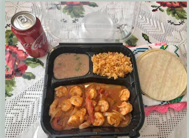
Chipotle shrimp with rice and beans