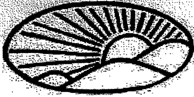
EXHIBIT A STATEMENT OF WORK