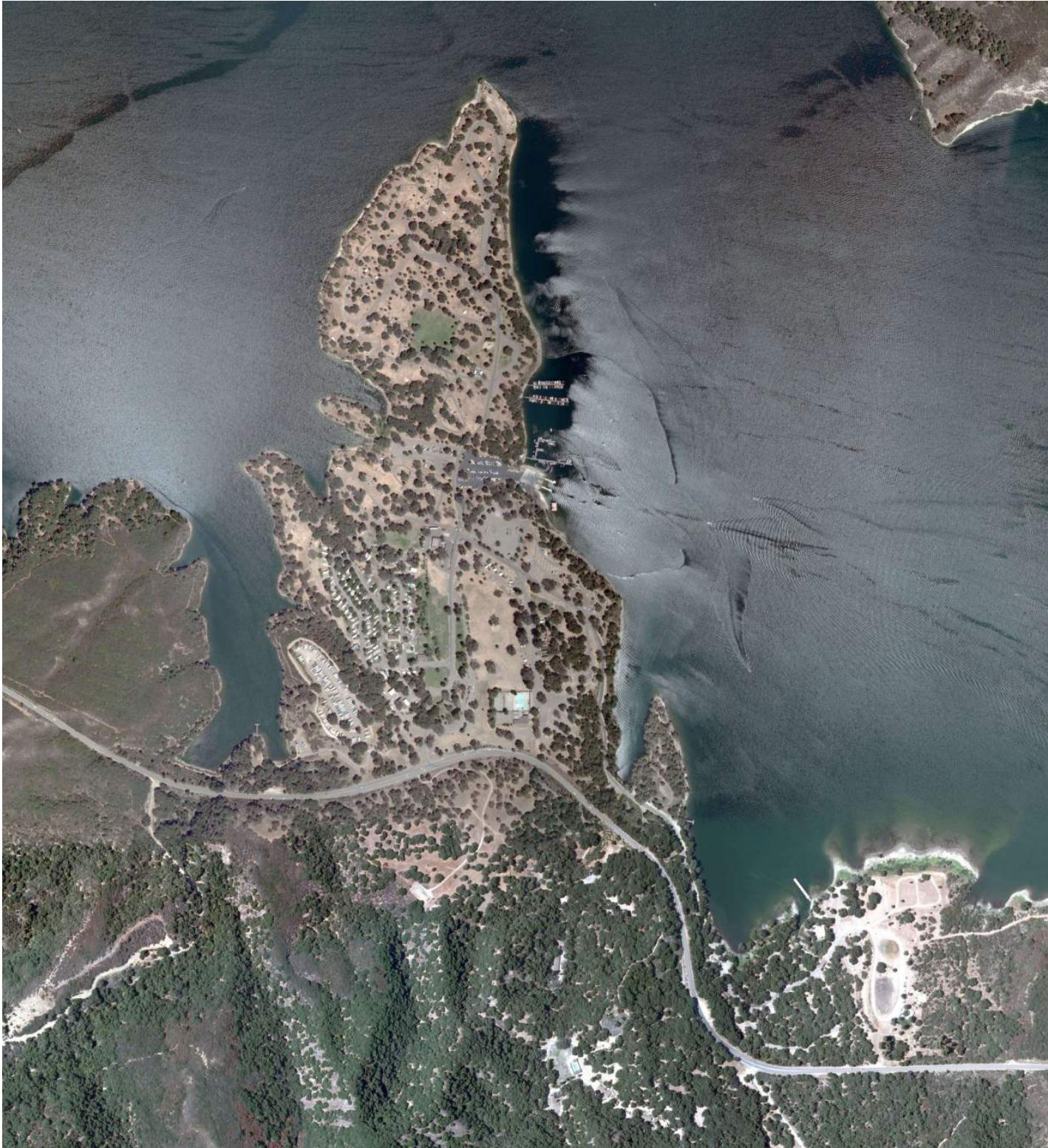
EXHIBIT A LAKE CACHUMA “Park”