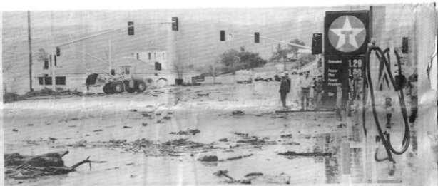
The intersection of Alamo Pintado and Mission Drive (Highway 246) was inundated by the rampaging waters of Alamo Pintado Creek Monday night.

Over eight inches of rain fell Sunday and Monday, causing hazardous road conditions throughout the valley