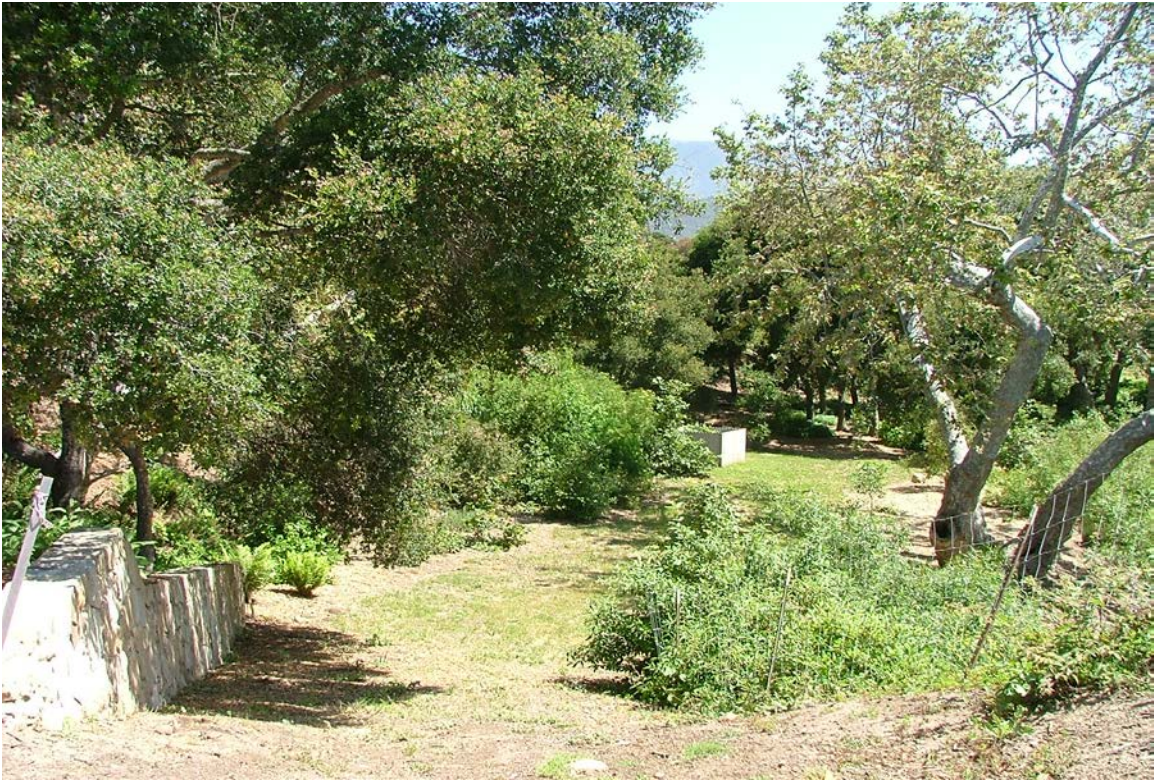
9. Same view as above. Terrace floor has been planted with western sycamore, holly-leaved cherry, arroyo willow, coast live oak, elderberry, coffeeberry, box elder, and western spice bush. Slope at right retains natural coast live oaks. Giant chain fern, western sword fern, alum root, hummingbird sage, canyon sunflower, California grape, blue-eyed grass, seacliff buckwheat, and other species. 22 May 2012.