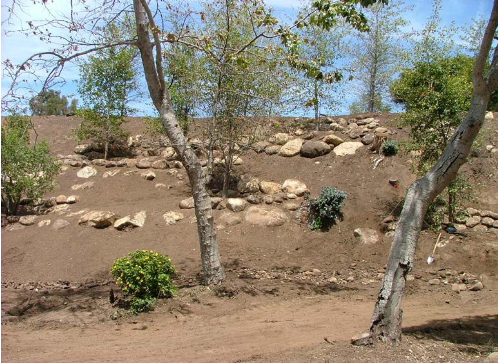
1. Southern terrace slope looking southwest. Non-native vegetation has been removed and boulders were placed on slope to stabilize soil for planting sites. Coast live oaks and white alder have been planted on slopes. 12 September 2009.