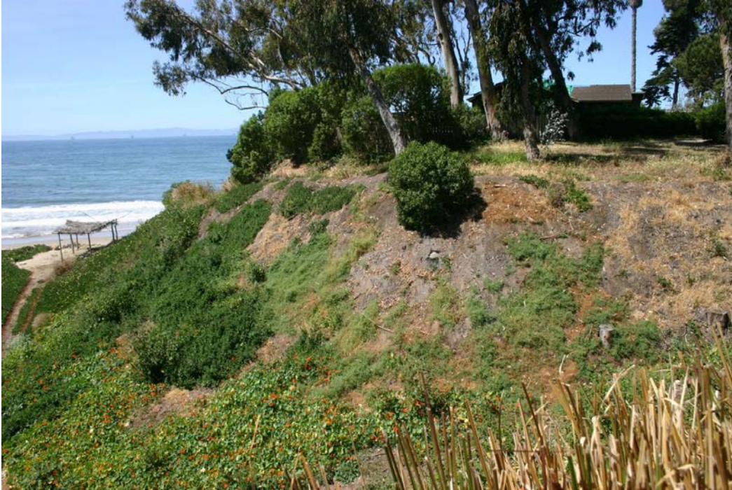
25. Cage gabion slope looking south. 5 May 2009 (photo courtesy of M. Mooney).