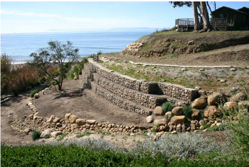
26. Same view, 20 February 2012.