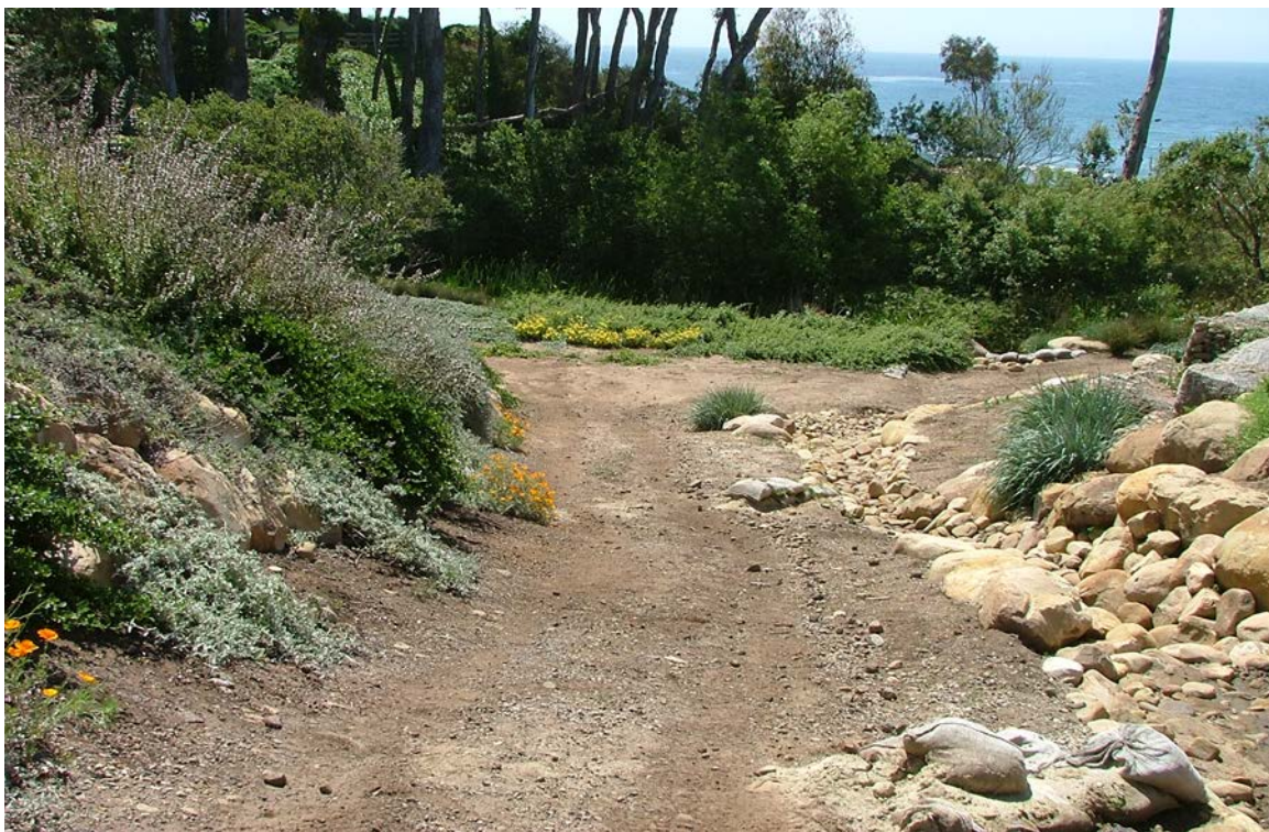
24. Same view. Terrace slope at left has been planted with purple sage, ceanothus, and other coastal bluff scrub shrubs. Slope at right has not yet been restored. Erosion channel has been lined with cobbles and will be restored with freshwater marsh species. Vegetation on terrace floor and bank of Toro Canyon Creek includes beach strawberry, CA blackberry, yarrow, Indian rush, yellow nut-grass, and other species. 22 May 2012.