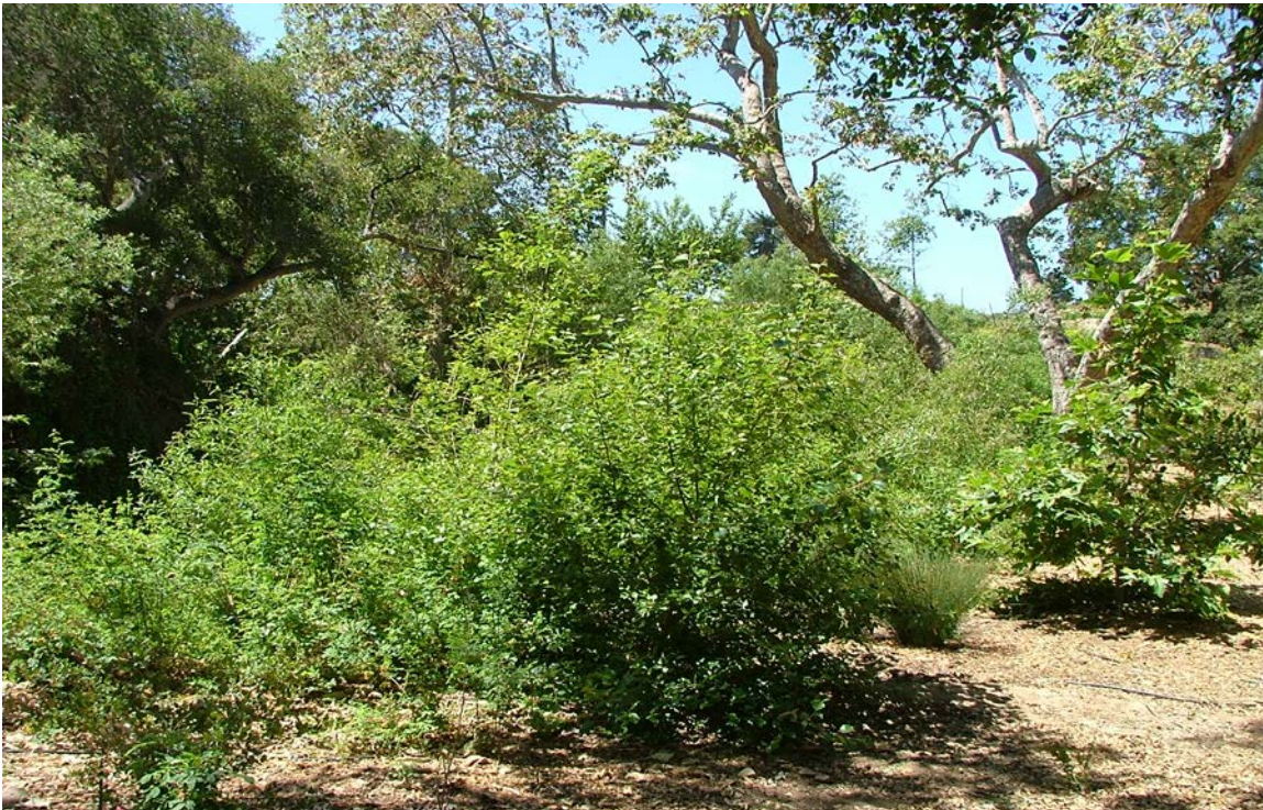
18a. Same area on 22 May 2012. Oak woodland on slopes at left grades into riparian scrub and oak-sycamore riparian woodland on floor of stream terrace. Toro Canyon Creek is right of large sycamore.