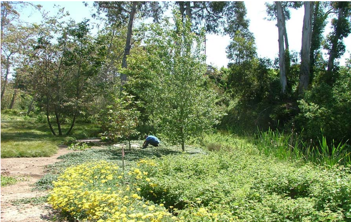
4. Same site as above, after restoration. Non-native vegetation has been replaced with California blackberry, yarrow, beach strawberry. Planted trees include black cottonwood and western sycamore. Western bank of creek supports common horsetail, cattails, and yellow nut-grass. Eastern bank is covered with cape ivy and other non-native species (see next photo). 22 May 2012.