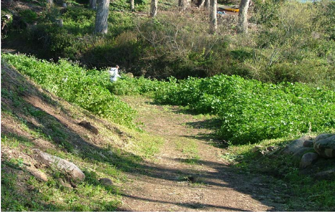
23. Path to southern stream terrace and beach before restoration. Worker is spraying bull mallow with a systemic herbicide (Rodeo). Toro Canyon Creek is behind worker. Note weedy, disturbed condition of terrace slopes. Note erosion channel running downslope along toe of slope at right. 3 February 2010.