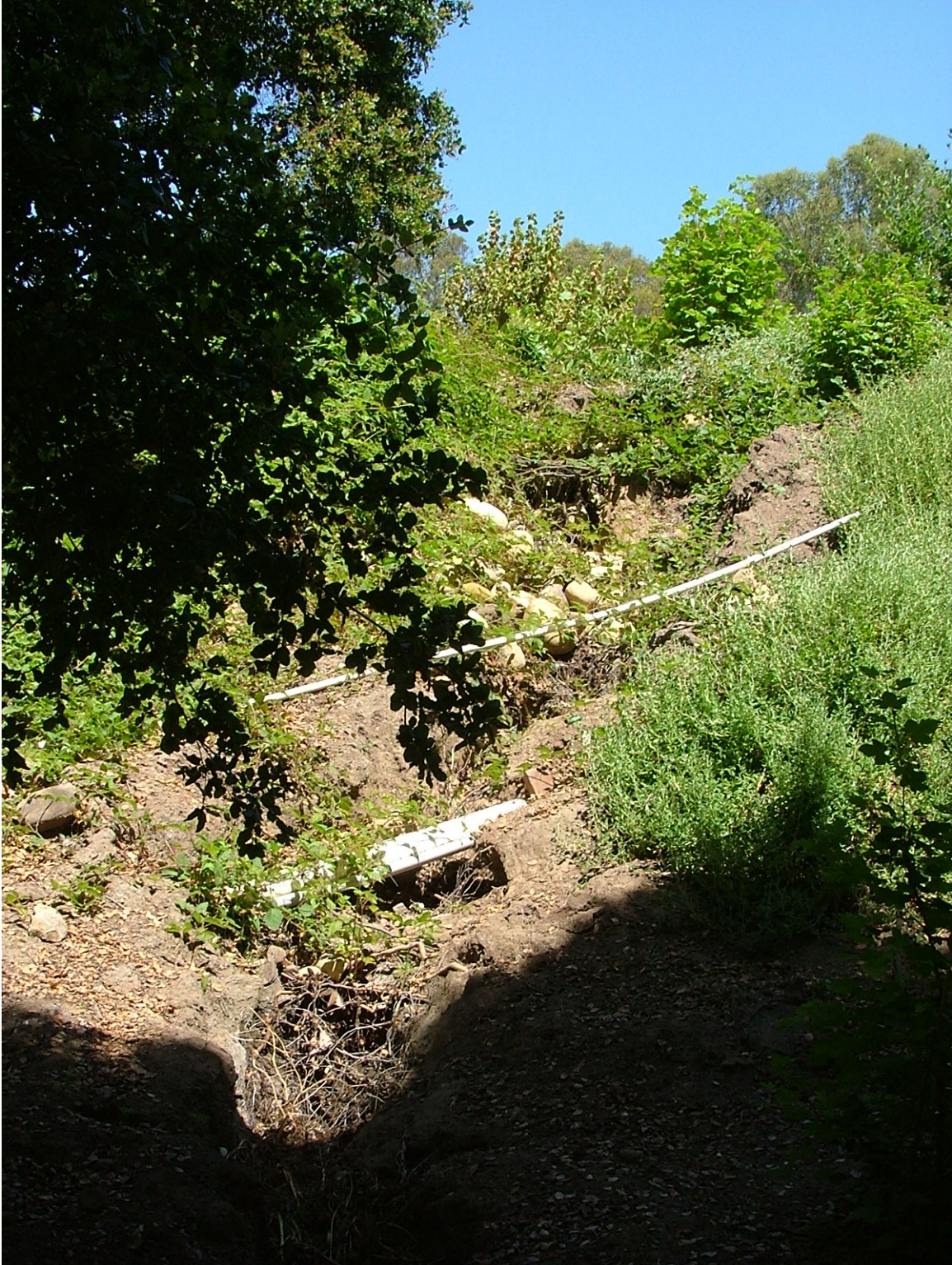
27. Erosion feature on slope of north terrace that will be restored as the north bioswale. Surface flows from the northern half of the property are severely eroding this slope and creating significant sediment inputs to Toro Canyon Creek during storm events. 22 May 2012.