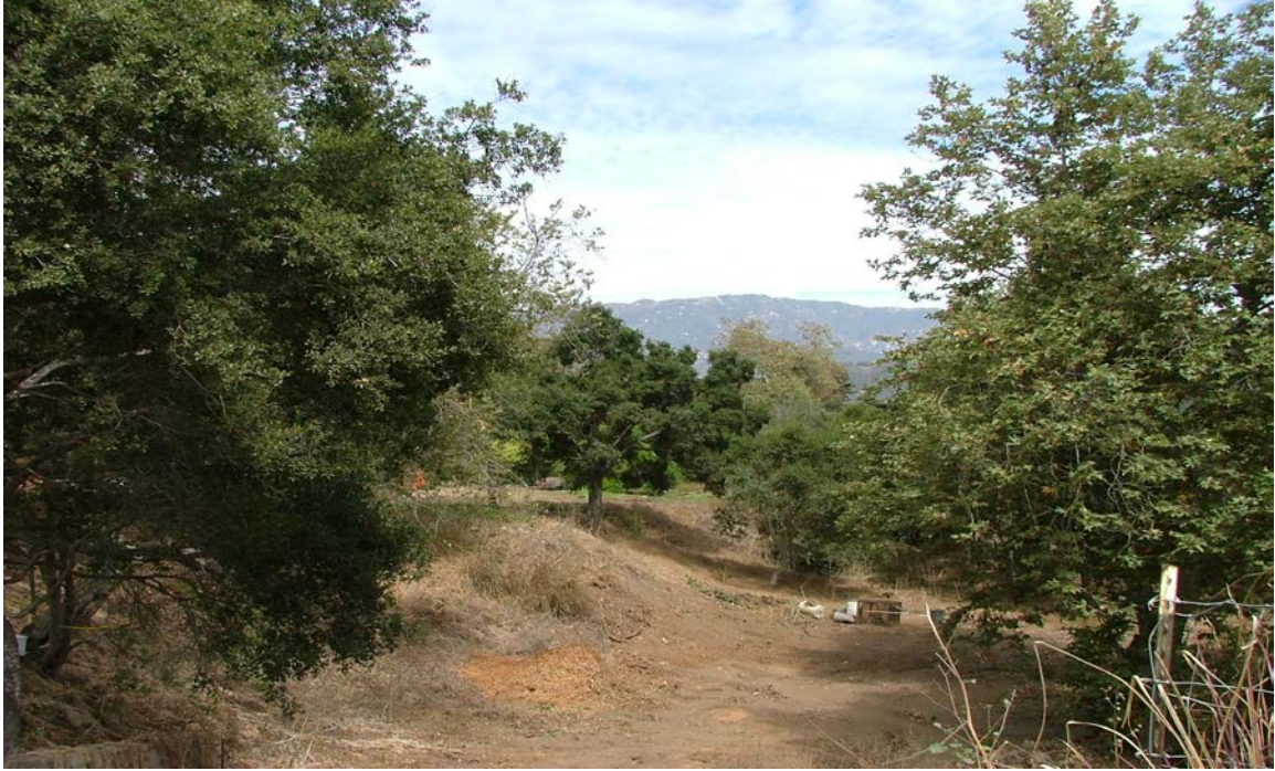
8. Northern terrace, looking north, prior to restoration. Well is visible in center of terrace. Horse corrals have been removed. Note condition of terrace floor and adjacent slopes. 12 September 2009.