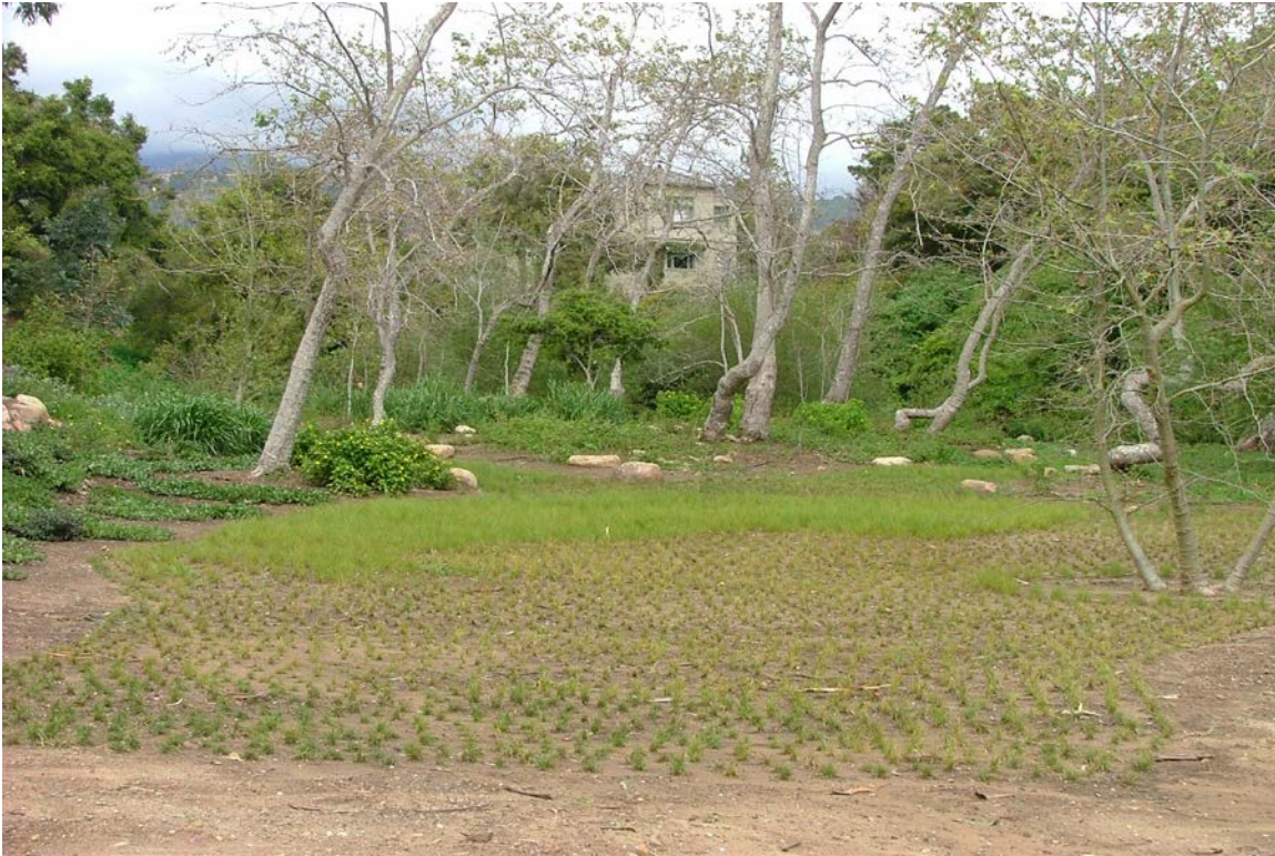
19. Floor of southern stream terrace just after planting dune sedge plugs. 22 March 2011.