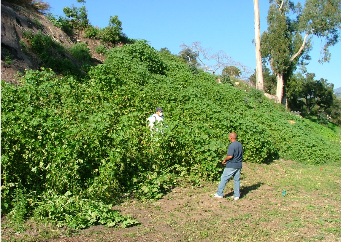
12. Slopes of southern stream terrace, prior to restoration, covered with bull mallow. 3 Feb 2010.