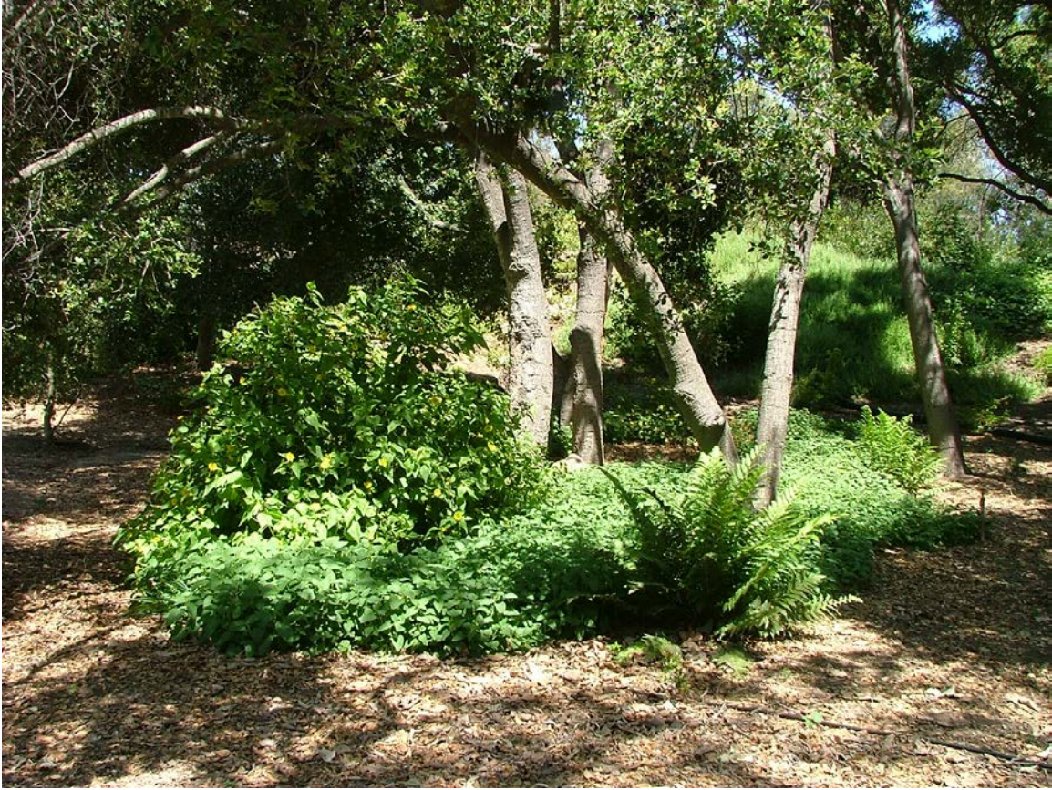
18b. Oak woodland and oak-sycamore riparian woodland restoration on north stream terrace. Understory plantings include canyon sunflower, wood mint, giant chain fern, western sword fern, elderberry, California grape, and other species. Terrace slope in background has been planted with seacliff buckwheat, which grades into other coastal bluff scrub shrubs in upland areas. 22 May 2012.