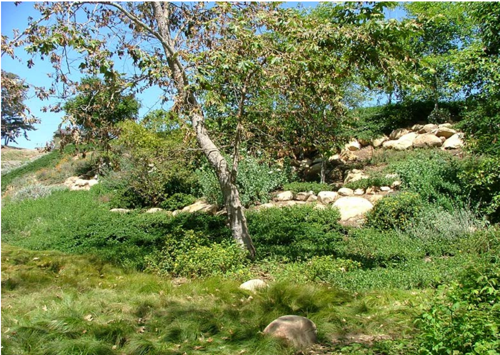
2. Same site as above after revegetation with native species. Dune sedge (left) and wood mint (right) on terrace floor grades into canyon sunflower, seacliff buckwheat, ceanothus, gum plant, common aster, elderberry, and other species on slope. 22 May 2012.