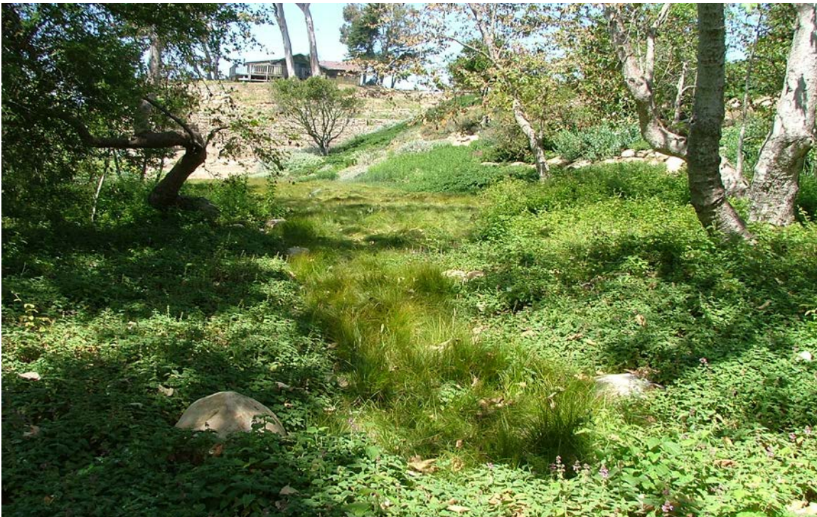
22. Same view as in previous photo. Successful restoration of oak-sycamore riparian woodland and riparian scrub. Weedy slope in background will be restored pending permitting of the cage gabion wall. 22 May 2012.