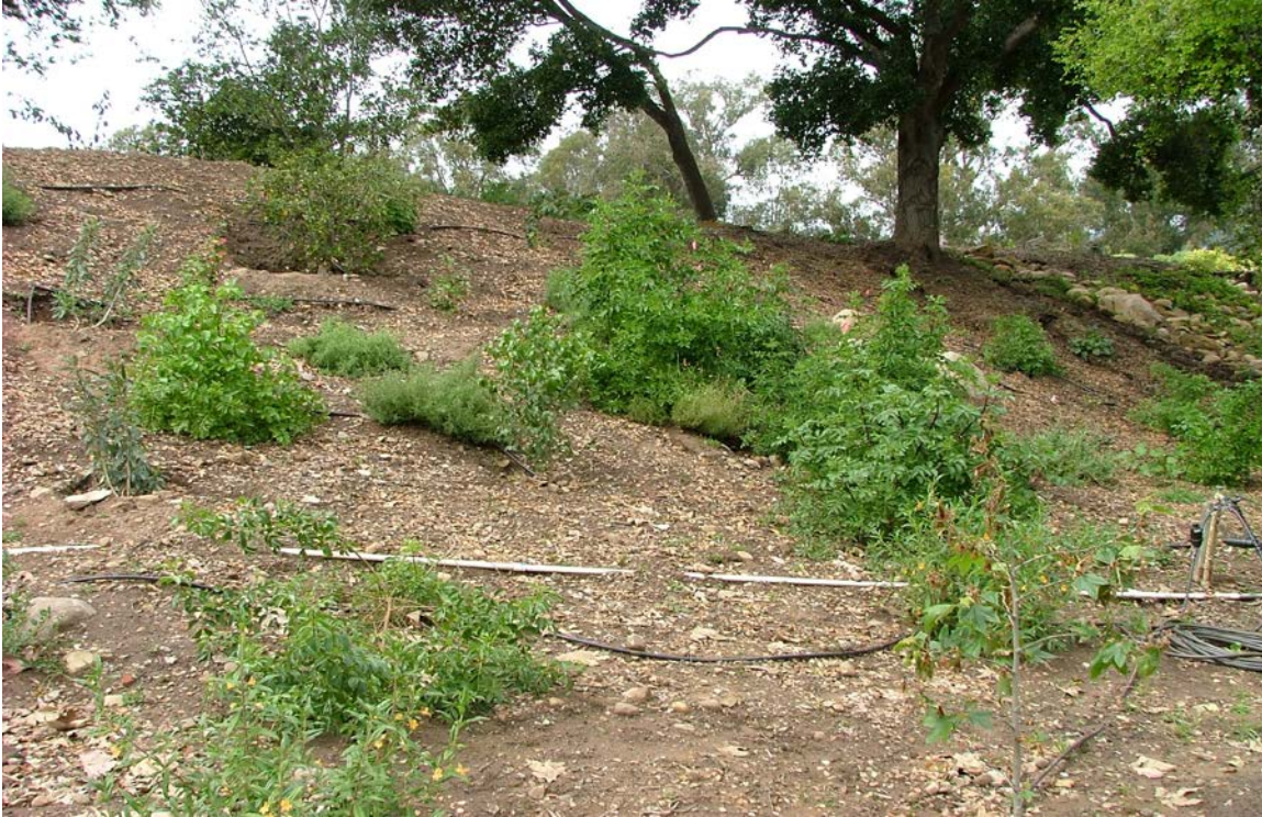
17. Northern stream terrace slopes at start of plant installation. Slopes were formerly covered with garden nasturtium ( Tropaeolum majus ) and fumitory ( Fumaria officinalis ). Species planted here include coast live oak, giant chain fern, western sword fern, alum root, elderberry, southern bush monkeyflower, and a variety of other oak woodland and oak-sycamore riparian woodland species. 14 December 2010.