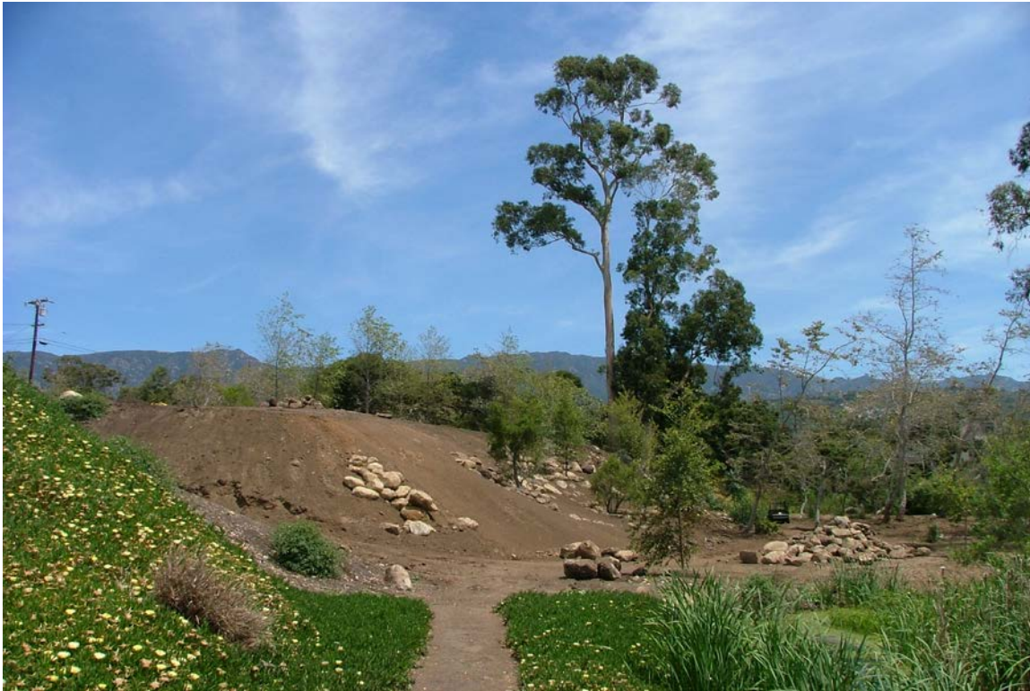
15. Southern terrace and slopes looking north from beach, prior to restoration. Path to beach runs through cut in slope at left and down center of photo. Note ice plant on adjacent slopes. 28 May 2010.