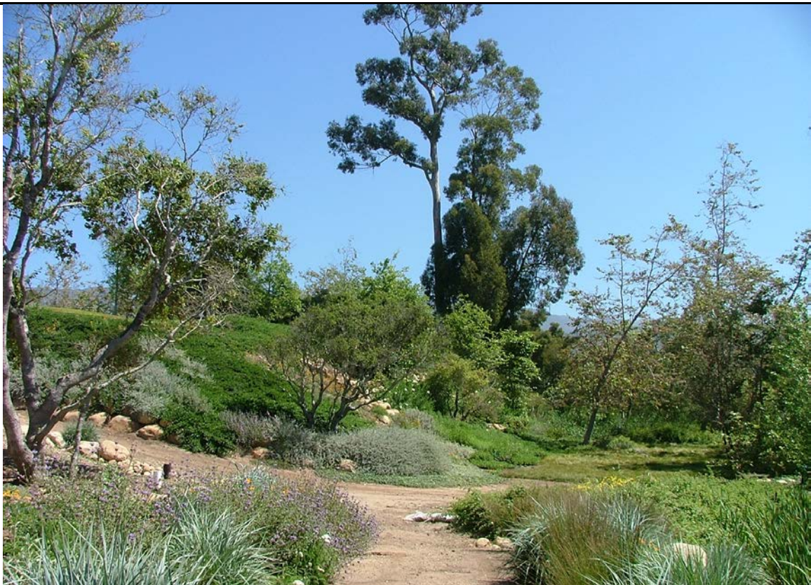
Southern stream terrace, looking north. 22 May 2012.