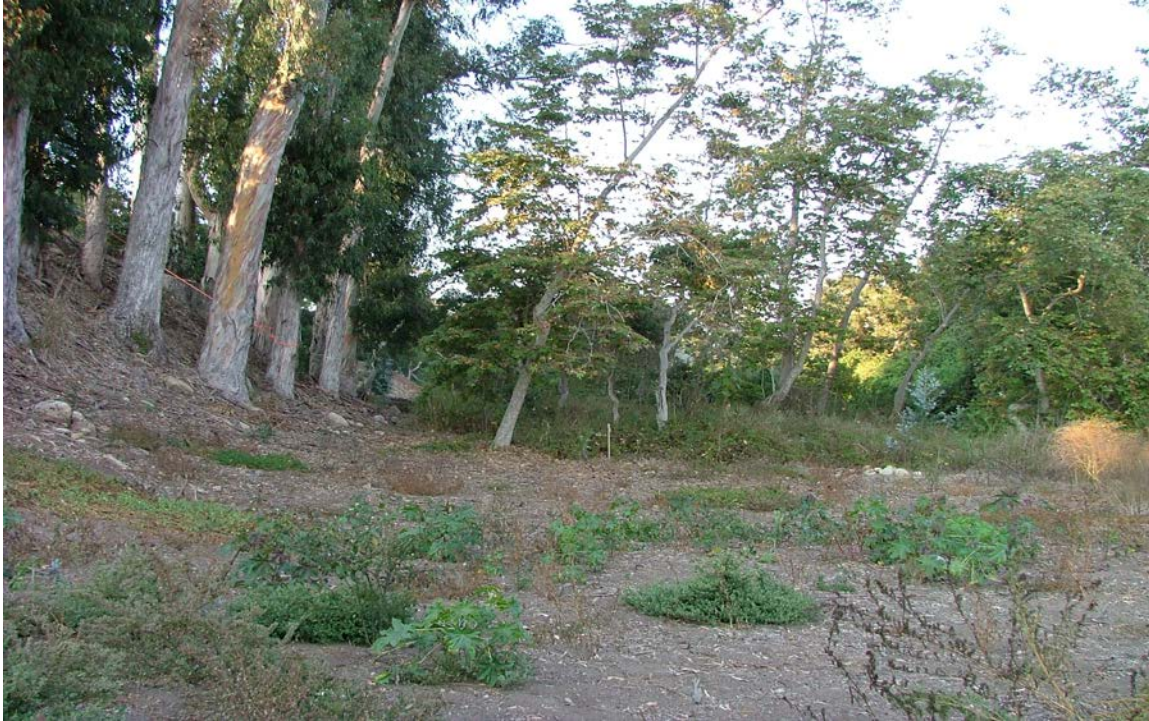
6. Southern stream terrace, looking north, prior to restoration. Slopes at right were covered with mostly dead or dying blue gum eucalyptus. Floor of terrace was either bare soil or weeds (castor bean, bull mallow, ice plant, etc.), with a few scattered western sycamores and blue gum saplings. 12 September 2009.