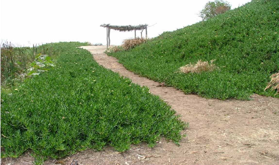
10. Lower terrace, looking south from edge of creek toward beach. Southern stream terrace and adjacent slope, prior to restoration. Slope and creek banks are covered with ice plant and other non-native vegetation. When this vegetation was removed, slope soils were too unstable to plant. 12 September 2009.