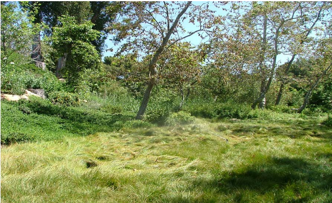
7. Same view as above, after restoration. Healthy eucalyptus trees have been retained (upper left). Portions of terrace floor have been planted with dune sedge, which grades into patches of giant rye, California rose, wood mint, and canyon sunflower. Western sycamore, black cottonwood, box elder, and arroyo willow have been planted along edges of terrace and on creek banks. Ceanothus, elderberry, mugwort, and other species have been planted on the slope at right. 22 May 2012.