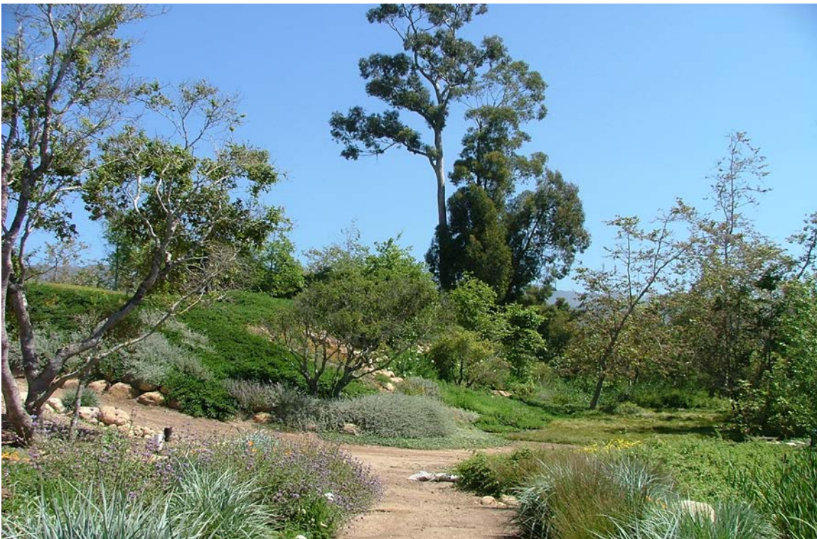
16. Same view after restoration. Non-native vegetation and bare soil has been replaced with coastal bluff scrub, riparian scrub, and oak-sycamore riparian woodland species. 22 May 2012.