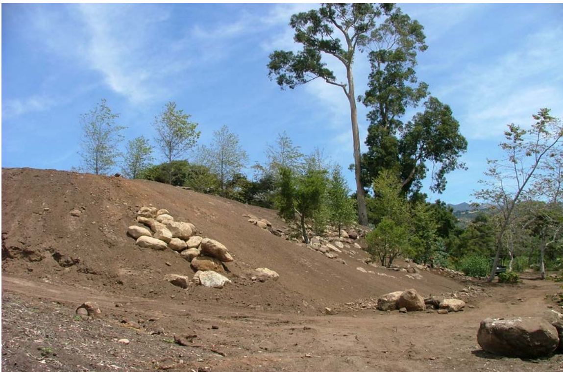
13. Same view, after non-native vegetation has been removed. 28 May 2010.