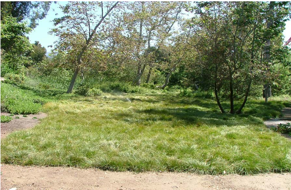
20. Same view on 22 May 2012. Toro Canyon Creek runs left to right behind trees in background then off right side of photo to ocean. Bare soil in foreground is portion of terrace floor that will be restored with restoration of cage gabion wall.