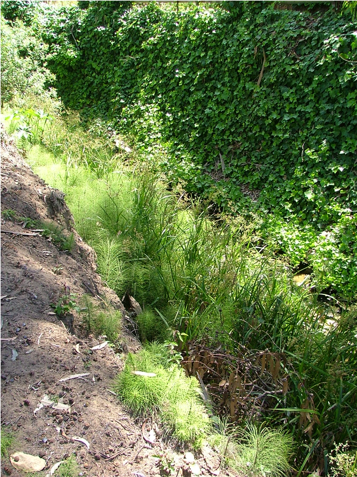
5. Banks of Toro Canyon Creek adjacent to southern stream terrace showing effects of restoration. Before restoration, the western bank (foreground) used to be covered with same non-native species that still cover the eastern bank (neighboring property). Natives here include scouring rush, cattails, and yellow nut-grass. Eastern bank is a mixture of Algerian ivy and cape ivy. 22 May 2012.