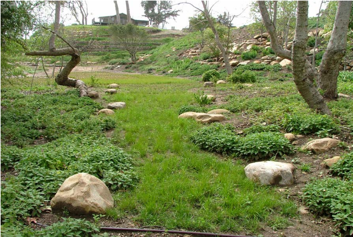
21. Southern terrace floor looking southwest, a few months after planting. Dune sedge covers footpath. Ground cover to left and right of path is wood mint, California rose, canyon sunflower, and California blackberry. 22 March 2011.