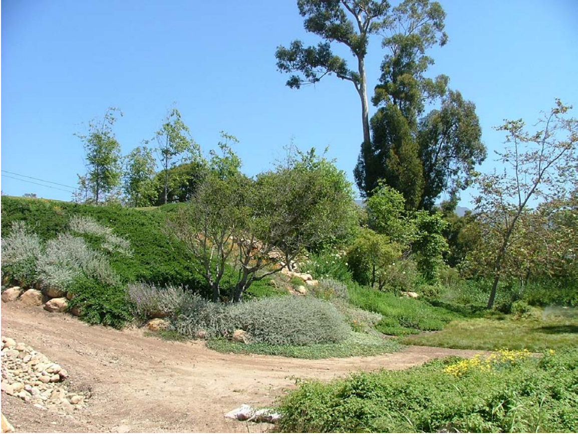
14. Same view after restoration. Slopes shrubs include purple sage, ceanothus, and other native shrubs. Trees planted here include coast live oak, western sycamore, and white alder. Terrace floor has been planted with dune sedge, beach strawberry, CA blackberry, wood mint, canyon sunflower, and other species. Former erosion channel at left has been lined with cobbles and will be planted with native freshwater marsh species. Bare soil will be planted with similar shrub and ground cover species as in adjacent areas. 22 May 2012.