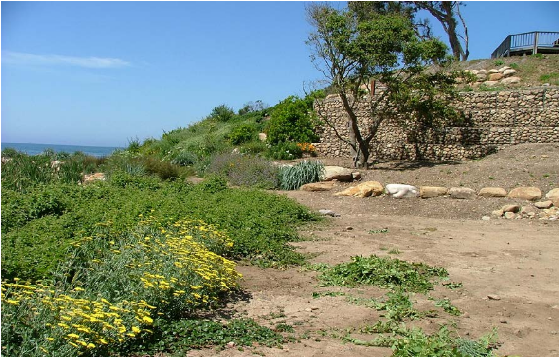
11. Same view as above. Cage gabion wall was installed to stabilize a portion of the slope for planting. Note proliferation of planted native vegetation along top of bank of creek at left. Ground cover includes yarrow, California blackberry, beach strawberry, giant rye, seaside daisy, and Indian rush. Slopes in background have been planted with coastal bluff scrub shrubs and ground cover. Cage gabion wall will get similar treatment. 22 May 2012.