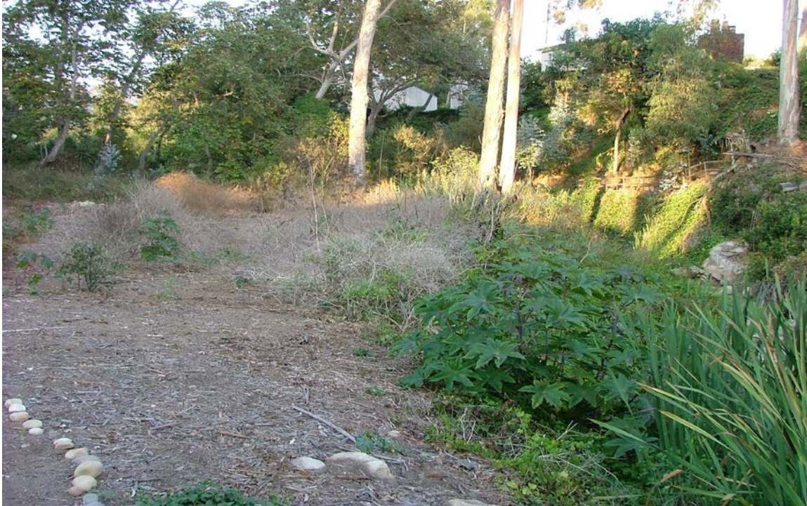
3. Southern stream terrace and western bank of Toro Canyon Creek, looking northeast, prior to restoration. Terrace was highly disturbed, with bare soil and large patches of invasive, non-native vegetation (mustard, castor bean, periwinkle, etc.). 12 September 2009.