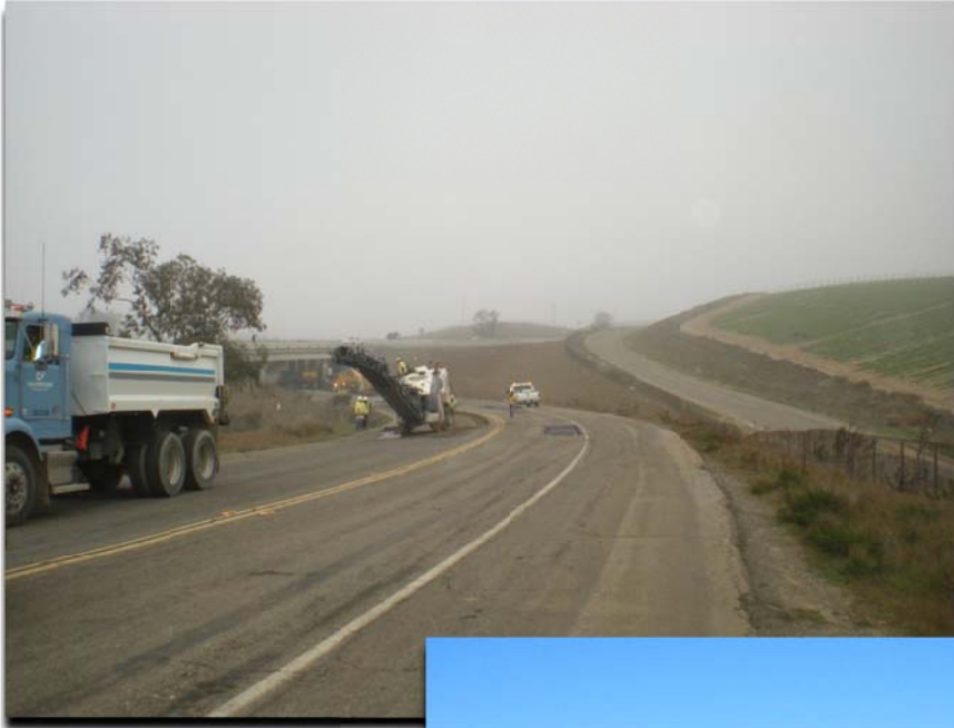
Construction on Santa Maria Way on east side of Hwy. 101, near on/off ramp, looking north