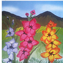
Orcutt's Colorful Gladiolas