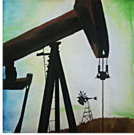
Pumping Oil in Orcutt by Selse Munroz