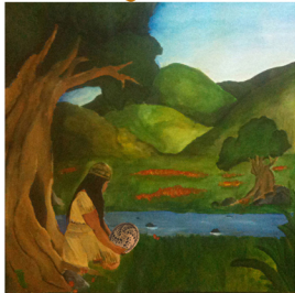
Chumash, The First People by Sean Hollinshead