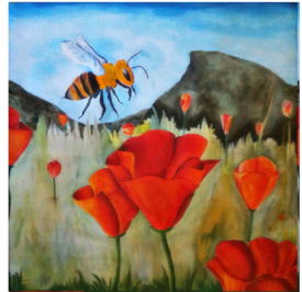
Spring Poppies on Orcutt Hill