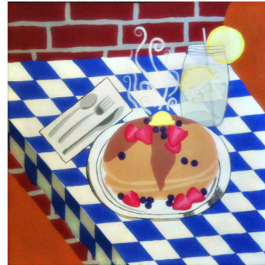
Locals Favorite by Elyssa Howe