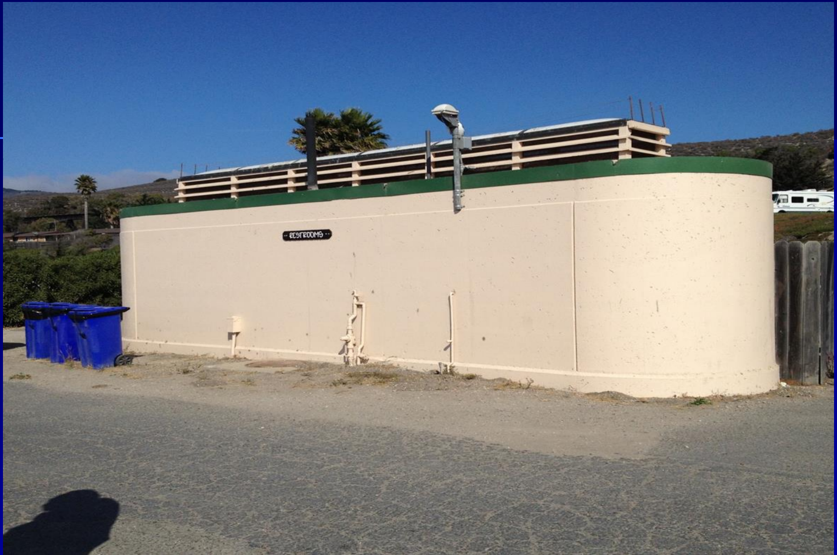
EXISTING LARGE RESTROOM – TWO (2) PROPOSED TO BE REPLACED