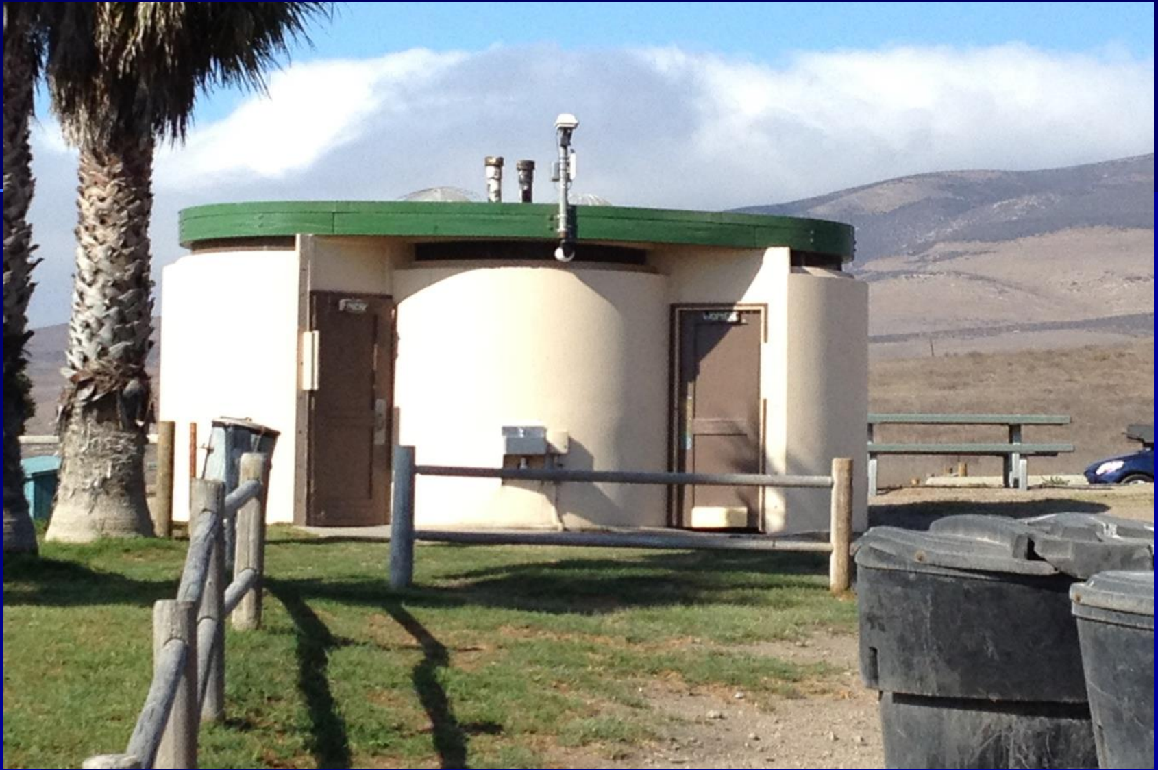
EXISTING SMALL RESTROOM – ONE (1) PROPOSED TO BE REPLACED