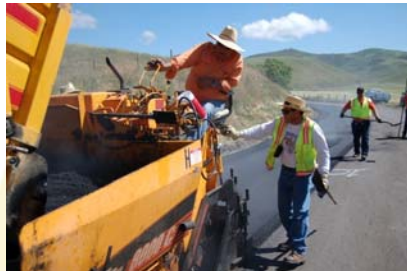
County of Santa Barbara Transportation Division 2011/2012 Road Maintenance Annual Plan