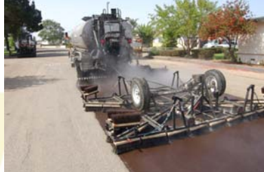
County of Santa Barbara Transportation Division 2011/2012 Road Maintenance Annual Plan