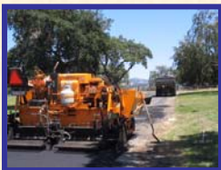
Cachuma Campground Rdwy Paving