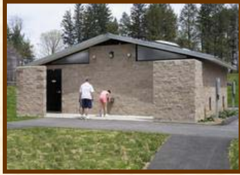
Purchase of Waller Park Don Potter Area Restroom