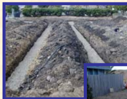
Jalama Beach Shower Leachfield System