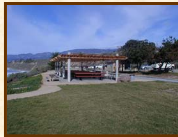
Completion of new reservable group picnic area at Rincon Beach County Park