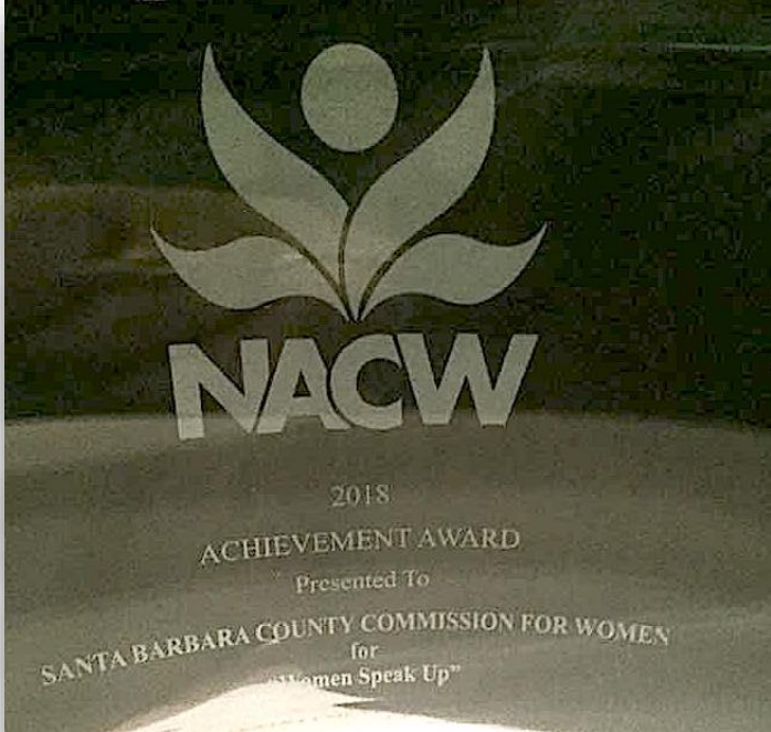
Close-Up Photo of Award