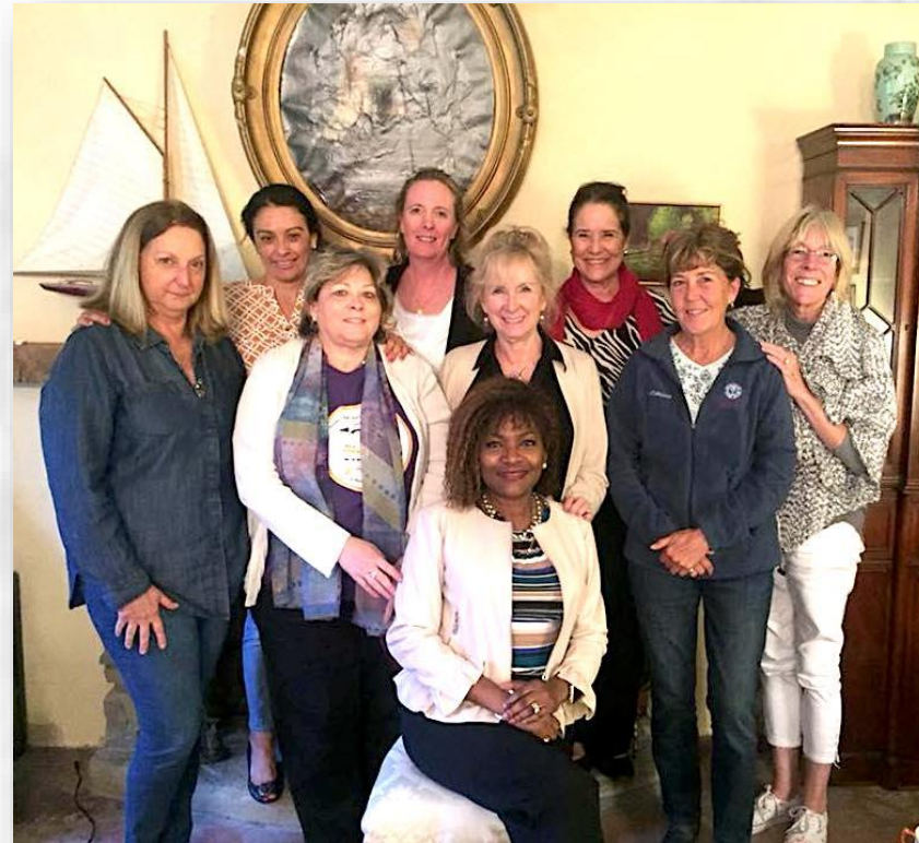
CFW Retreat Meeting, June 2018