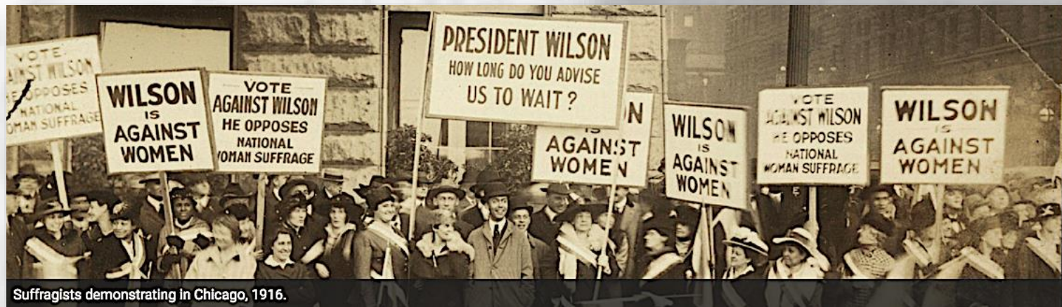
Suffragists demonstrating in Chicago, 1916.