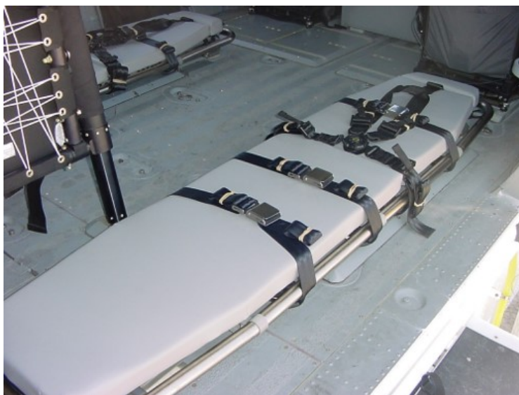
Fig. 2.2 Model 1555 Litter