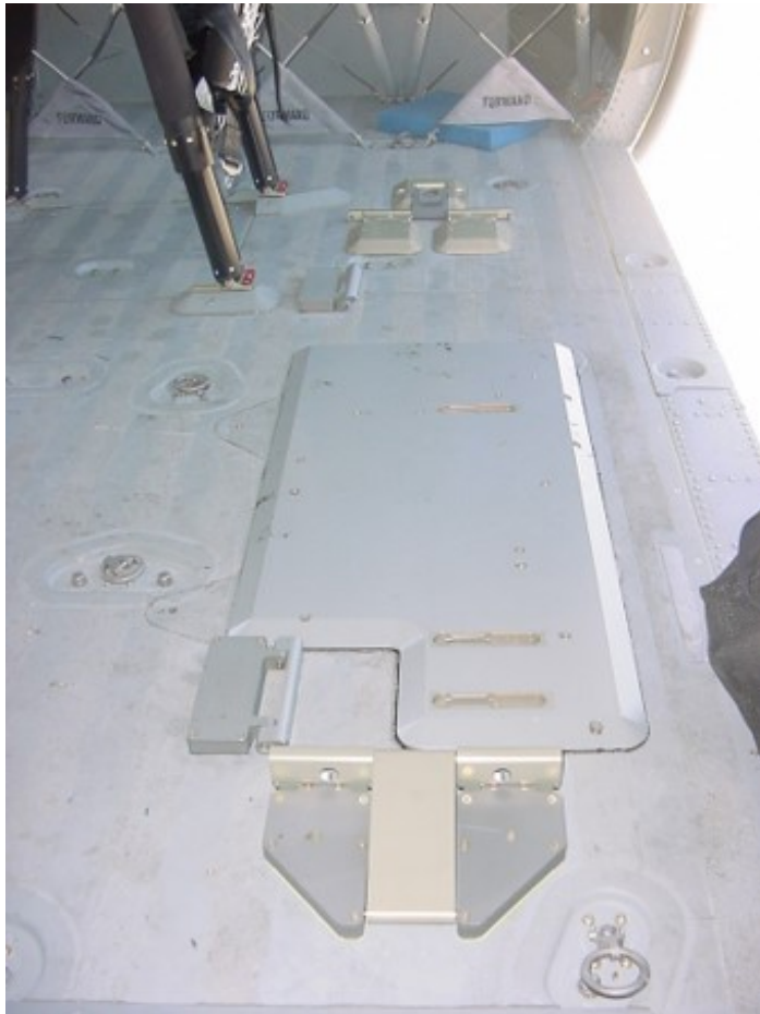
Fig. 2.1 Cabin Floor Litter Latch system