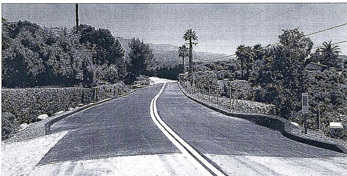
After – Ortega Ridge Road