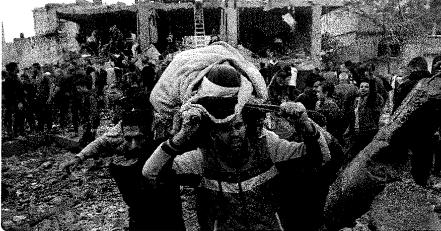
A wounded woman is evacuated following Israeli airstrikes in Khan Younis refugee camp

Rafah was overflowing with people by Thursday.