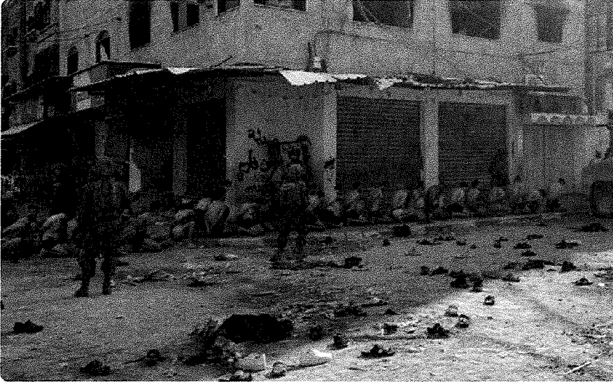
One report says the suspects were stripped to ensure they were not carrying weapons - EMANUEL FABIAN/X/TWITTER

The IDF has not commented on the images but at least some of them appear to have been taken from an Israeli army vehicle.