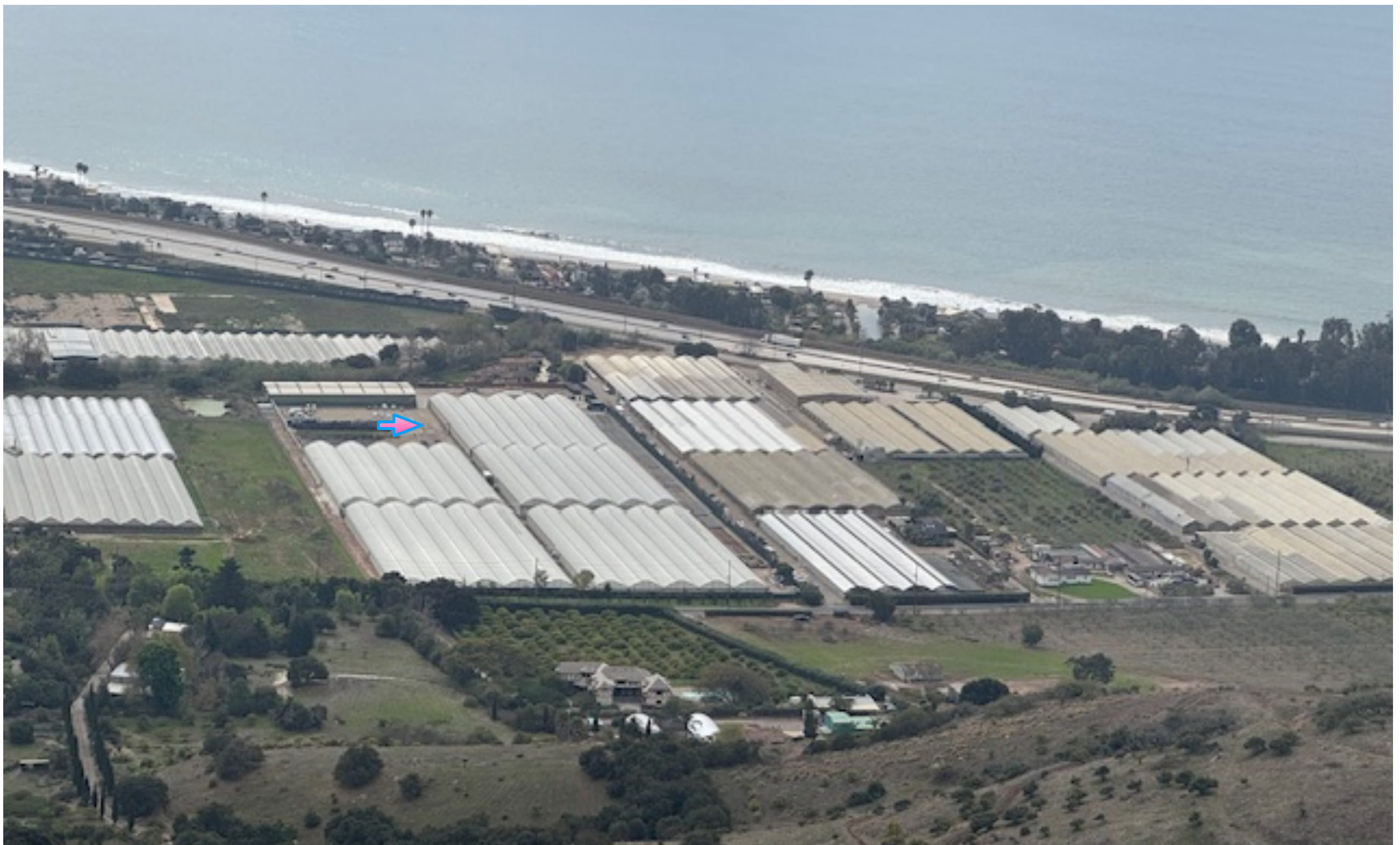
View of Proposed Cannabis Processing Site from Toro Canyon Ridge Public Hiking Trail