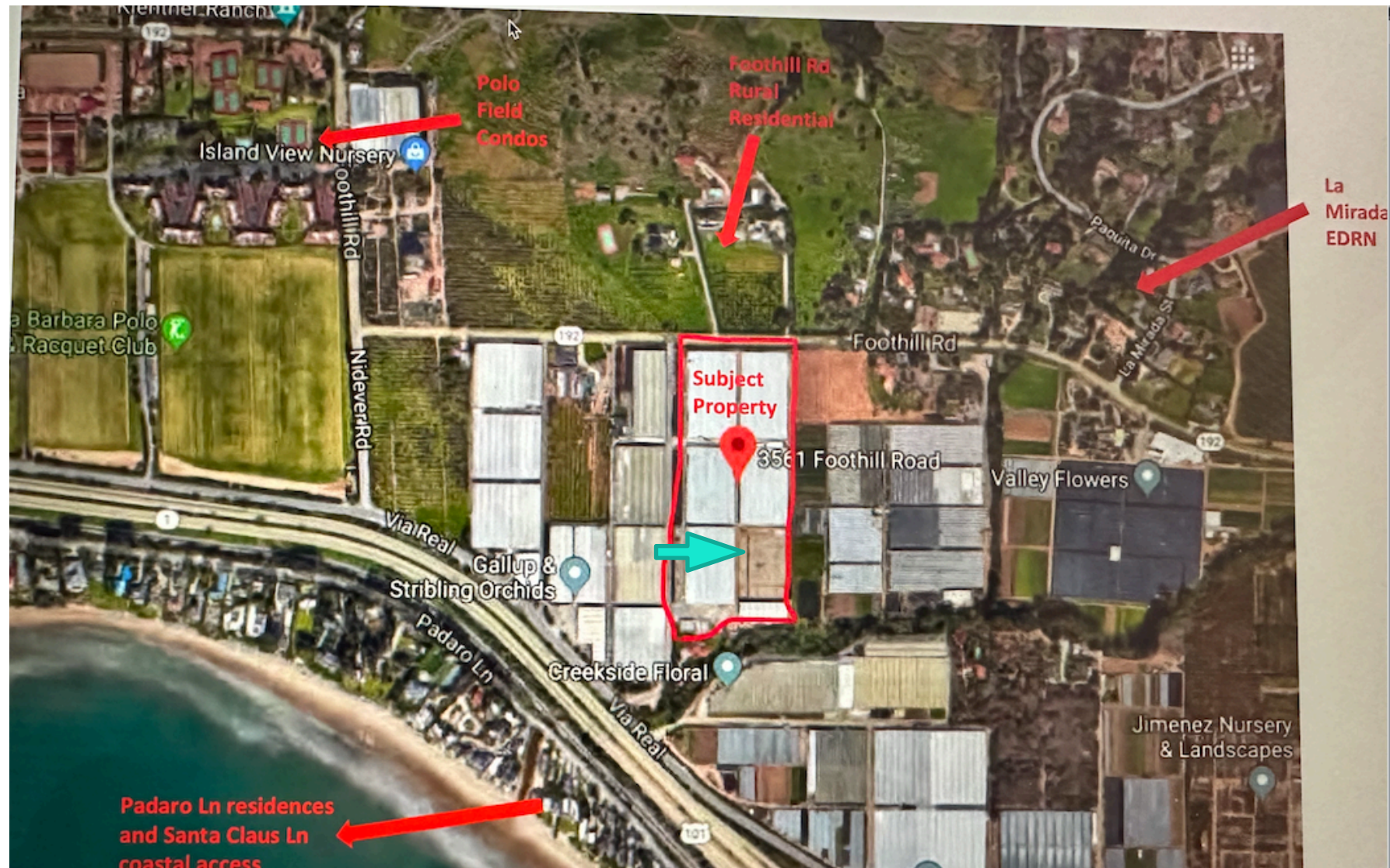
Blue Arrow Points to Proposed Cannabis Processing Facility