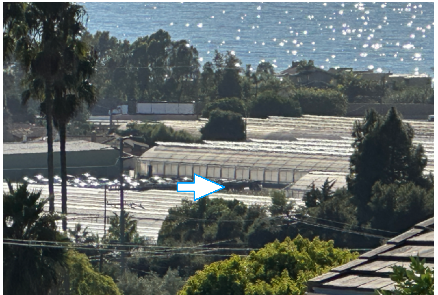
View of G&K Greenhouses, 3561 Foothill Rd., from Paquita Dr., La Mirada EDRN