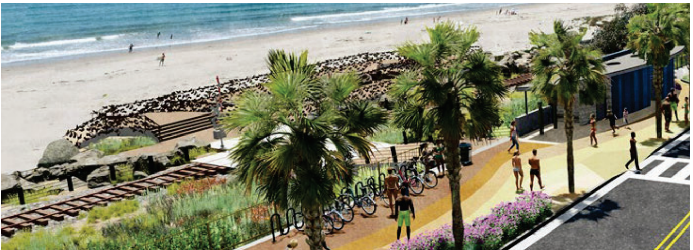
Santa Claus Lane, Beach Access-Rendering