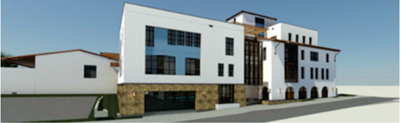
Probation Headquarters- Rendering