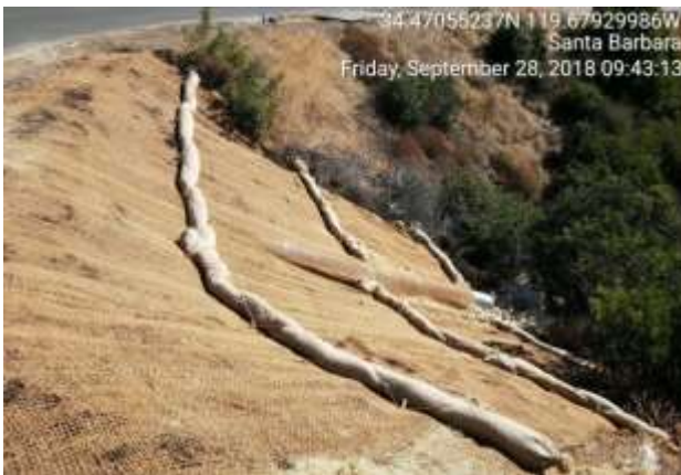
After construction – at MP 3.1 Gibraltar