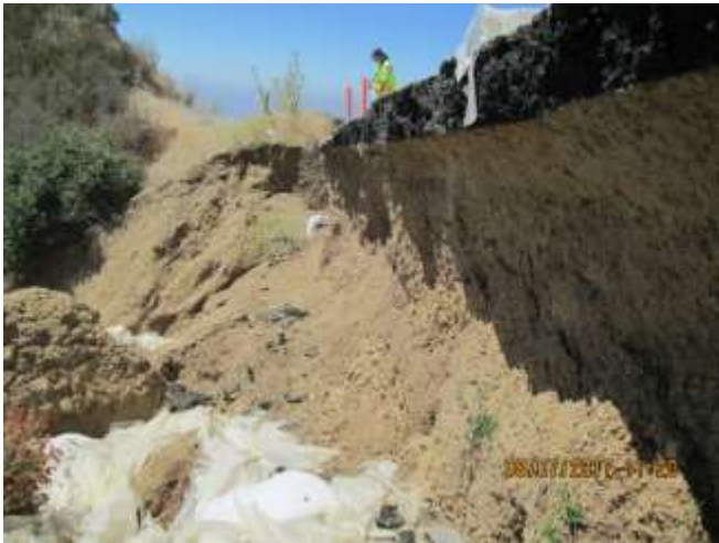
Before construction (Typical) – at MP 3.1 and 3.2 Gibraltar

Prior to construction, the roadway was down to a single lane under traffic control. The roadway is now restored to two way traffic. This project was developed to restore the slope, repair the failed road section, install an asphalt concrete swale, replace the failed drain structures and apply soil erosion control measures.