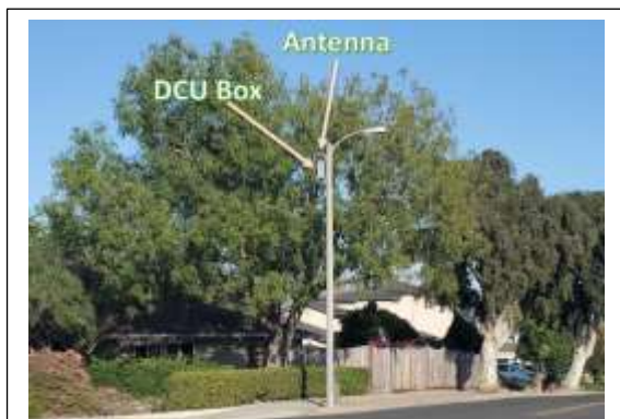
Figure 1. Example of a collocated DCU installation located in Goleta. Collocated facilities can be tied into existing power sources (e.g., streetlights) and do not require a solar panel or new support pole.

Figures 1 and 2, below, show representative natural gas telecommunications facilities installed in Goleta.