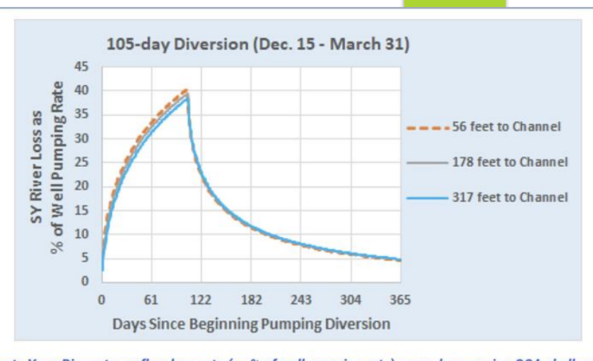
Figure 4. Santa Ynez River streamflow loss rate (as % of well pumping rate) cause by pumping CCA shallow alluvial we