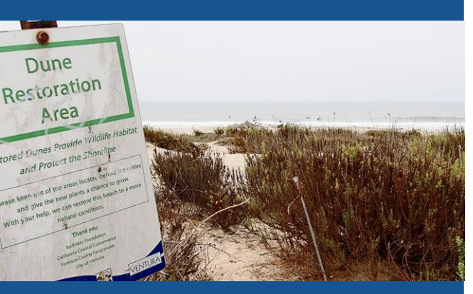
Surfer's Point, Ventura