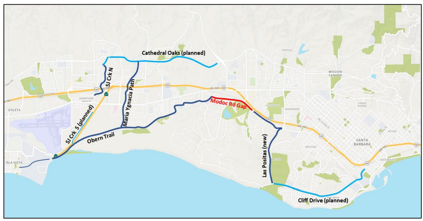
Figure 1: Modoc Multi-use Path gap infill

The Modoc Multi-use Path project will construct an off-road (Class 1) multi-use path along Modoc Road between the existing Obern Trail and the City of Santa Barbara multi-use path. It will complete the last major gap in this regional network identified in the Eastern Goleta Valley Community Plan and the Santa Barbara County Association of Governments Regional Active Transportation Plan (Figure 1).