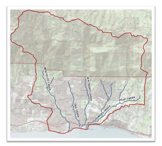
Figure 1. Project Study Area

Phase 1 will provide services through alternative formulation and the preferred alternative selection and is covered in this Scope of Work document. Phase 2 will provide conceptual design and the final Plan documents and is not included in this scope. It is anticipated that Phase 2 will be scoped separately upon completion of Phase 1.