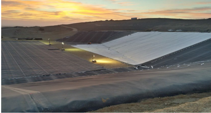
CQA during liner installation at Taft Landfill.

leachate collection and removal systems installation. Geosyntec's CQA field testing activities included compaction testing and visual classification of fill materials. Throughout the construction process, Geosyntec worked with the contractor to verify qualification testing and obtained conformance samples for laboratory testing and characterization. Geosyntec's CQA report was approved by the Central