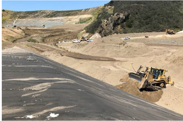
A dozer pushing protective cover soil up a lined slope at Tajiguas

approach may pose a challenge due to the impacts of settlement that occurs between the surveys. While potholing can be performed to verify cover thickness, this introduces the risk of damaging the underlying geosynthetics during the potholing process. To address this, Geosyntec proposes to monitor soil cover thickness during construction by means of cones or PVC pipes placed along the cover to serve as hike-up poles. This will allow direct observation of cover thickness which can be certified within the final construction quality assurance report.