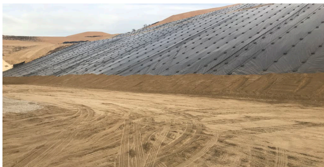
Liner system installed as part of the Phase 3A Construction.

Geosyntec Consultants, Inc. provided Construction Quality Assurance (CQA) and Engineering Support services for the approximately 4-acre Phase 3A construction project at Savage Canyon Landfill, an active Class III landfill in Whittier, California. As a part of the CQA services, Geosyntec monitored the construction and installation of mass excavation and unclassified fill, geosynthetics, leachate collection and