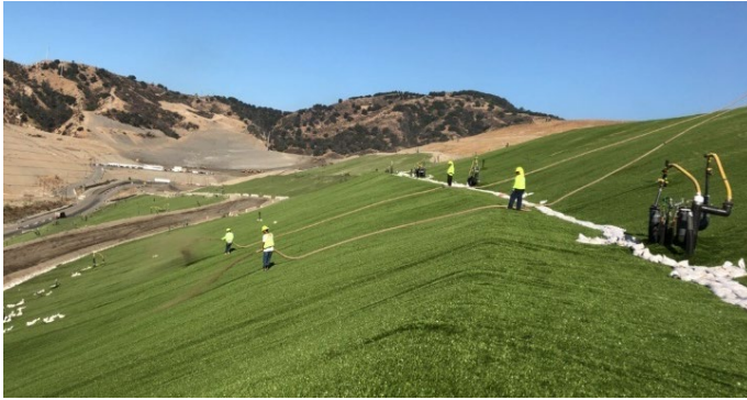
Installation crew spraying infill sand into the newly installed closure turf.

engineering technician onsite full-time for the duration of the project. Prior to geomembrane deployment, the Geosyntec CQA technician observed and documented subgrade preparation and performed nuclear density testing to evaluate compliance with specifications requirements. During geosynthetic installation, the onsite technician confirmed material deliveries, observed geomembrane