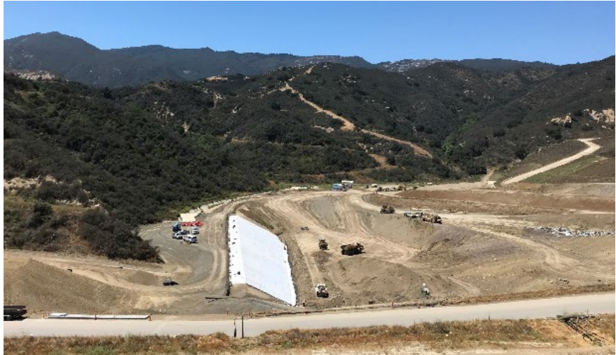
Geomembrane placed along an engineered fill berm during construction of Phase IIIC.

the contractor including geotextile, GCL, geomembrane, and geocomposite products. Geosyntec coordinated conformance testing of the products to ensure that the materials installed by the contractor met the project specifications. During geomembrane seaming, Geosyntec field personnel conducted nondestructive and