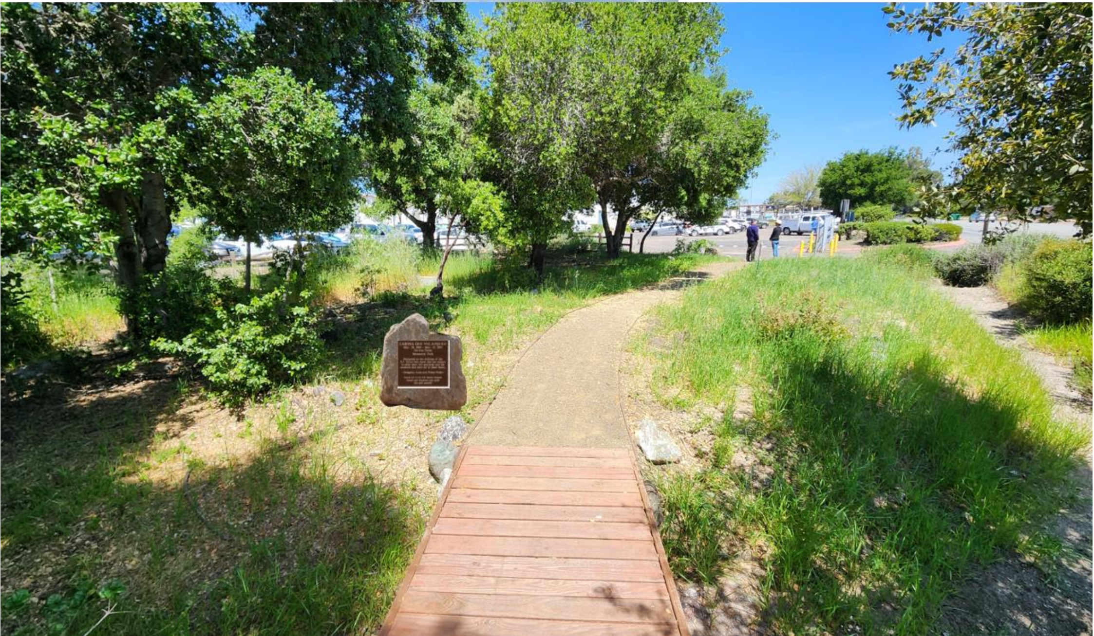
Mockup of Signage for Pedestrian Trail Naming – as of Sept. 8, 2023