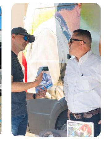
Reiter Affiliated Companies