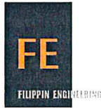
EXHIBIT A FILIPPIN ENGINEERING, INC. BILLING RATES EFFECTIVE JULY 1, 2023 to JUNE 30, 2024