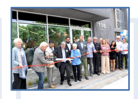
Vera Cruz Village