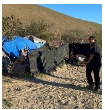
County Fire Assesses an Encampment

improve the safety and cleanliness of streets and open spaces; 2) meet the housing, shelter, and service referral needs of individuals experiencing homelessness; 3) improve the medical and behavioral health of individuals experiencing homelessness; and, 4) deliver coordinated services to effectively address and resolve encampments by developing efficient means to manage calls for service and prioritize resources, and effectively share information and coordinate resources countywide. The Encampment Response Coordinator tracks demographics in camps to limit inequities or disparities in service and outreach, such as the need for outreach targeted to monolingual Spanish-speaking persons in encampments.