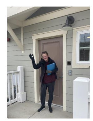
Client Moves from Encampments into Housing

The Encampment Resolution Strategy and Encampment Response Protocol approved by the County of Santa Barbara's Board of Supervisors is a 3-year effort (2021-2024) with the initial goal of resolving 45 encampments of varying size and impact on county-owned or countycontrolled property. The metrics initially approved anticipated counting encampments in large clusters. Mapping software and independent locations have changed the metrics to counting each encampment site rather than larger clusters.