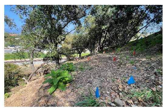
Former Encampment Site Undergoing Environmental Restoration