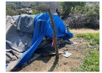
Active Encampment Site