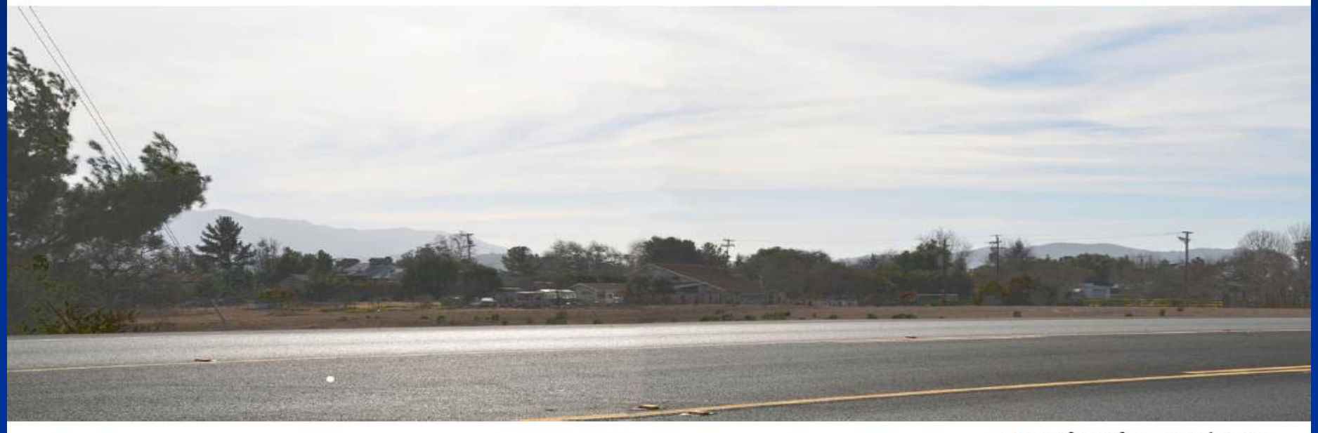
View of Site from North East