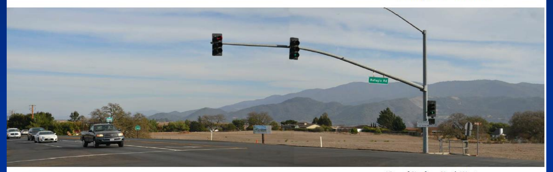
View of Site from North West