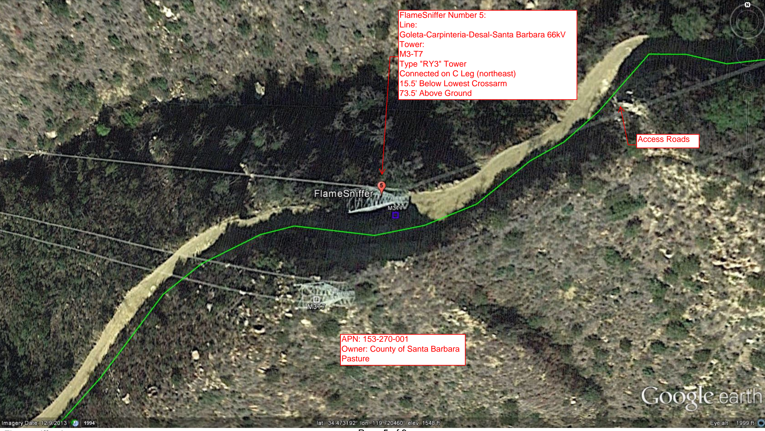
Page 5 of 9