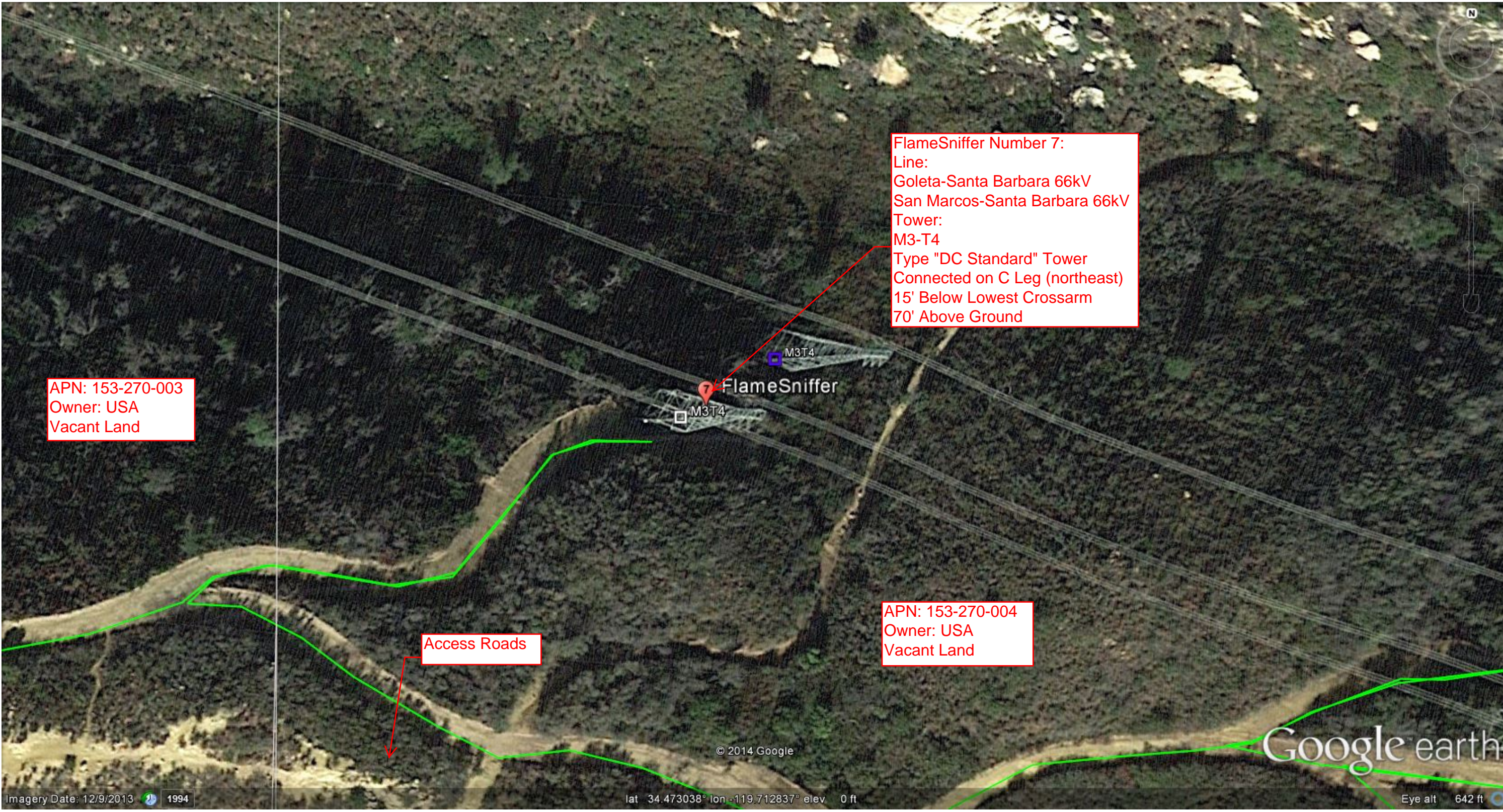
Page 7 of 9