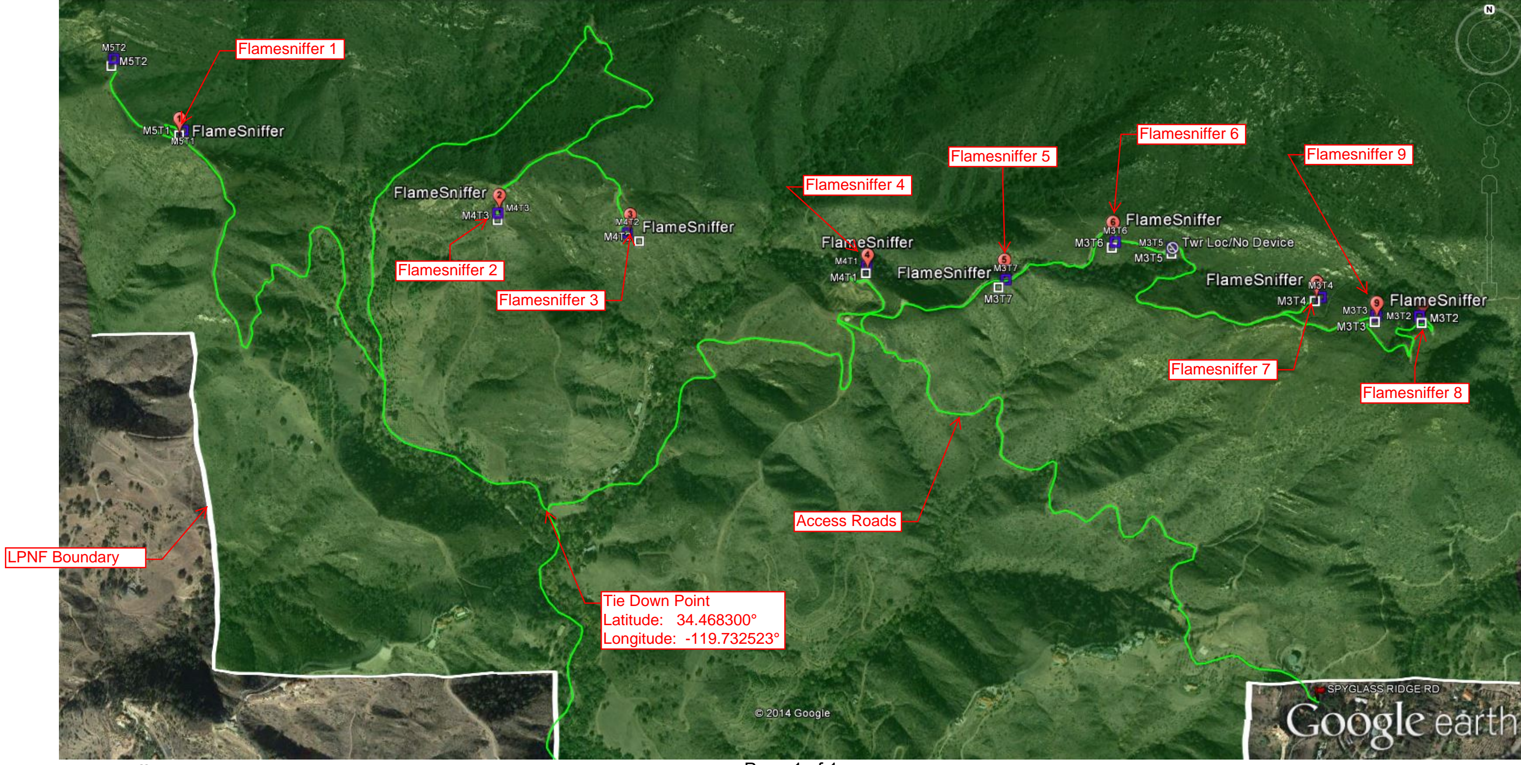
Page 1 of 1