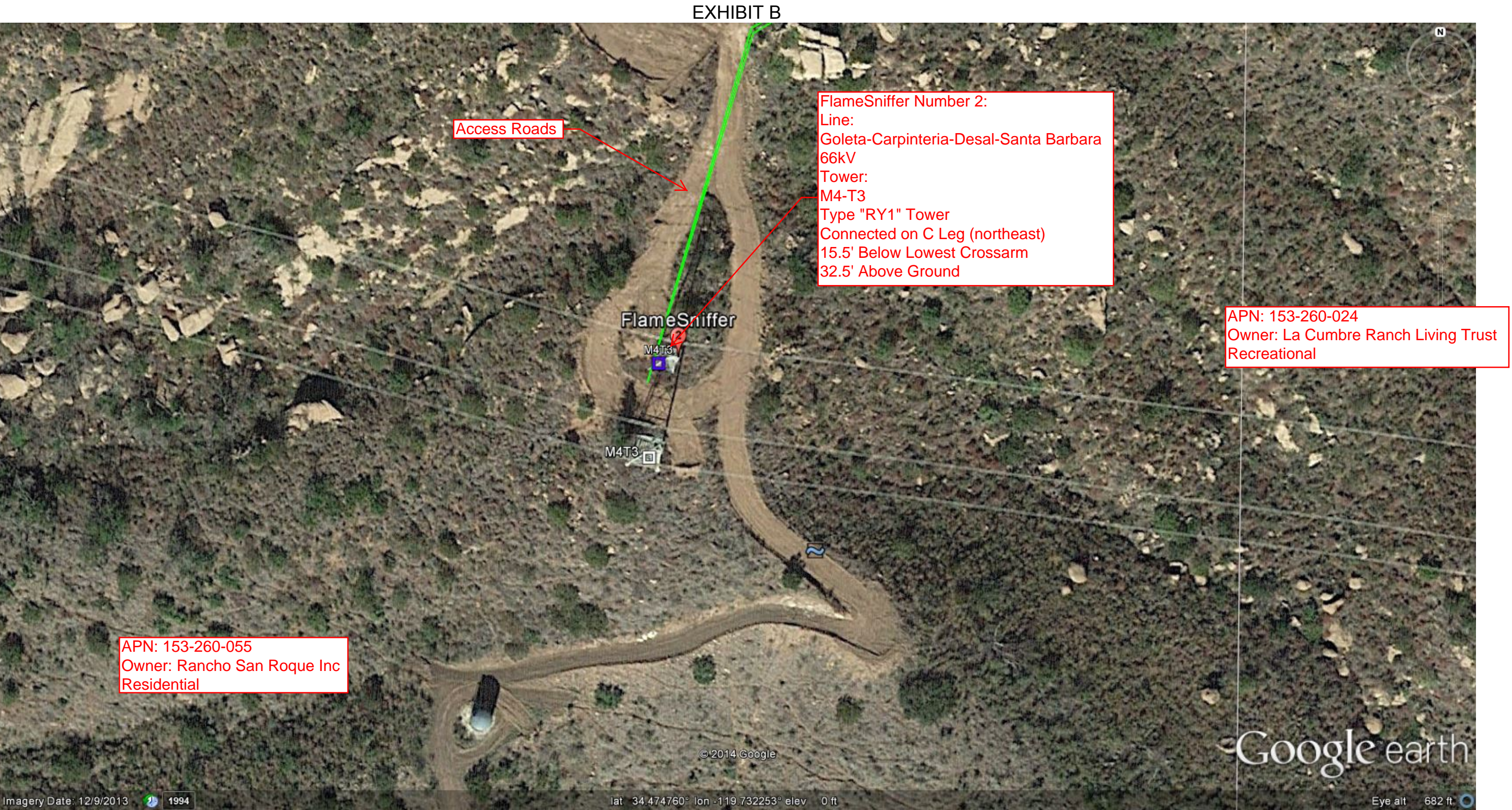
Page 2 of 9