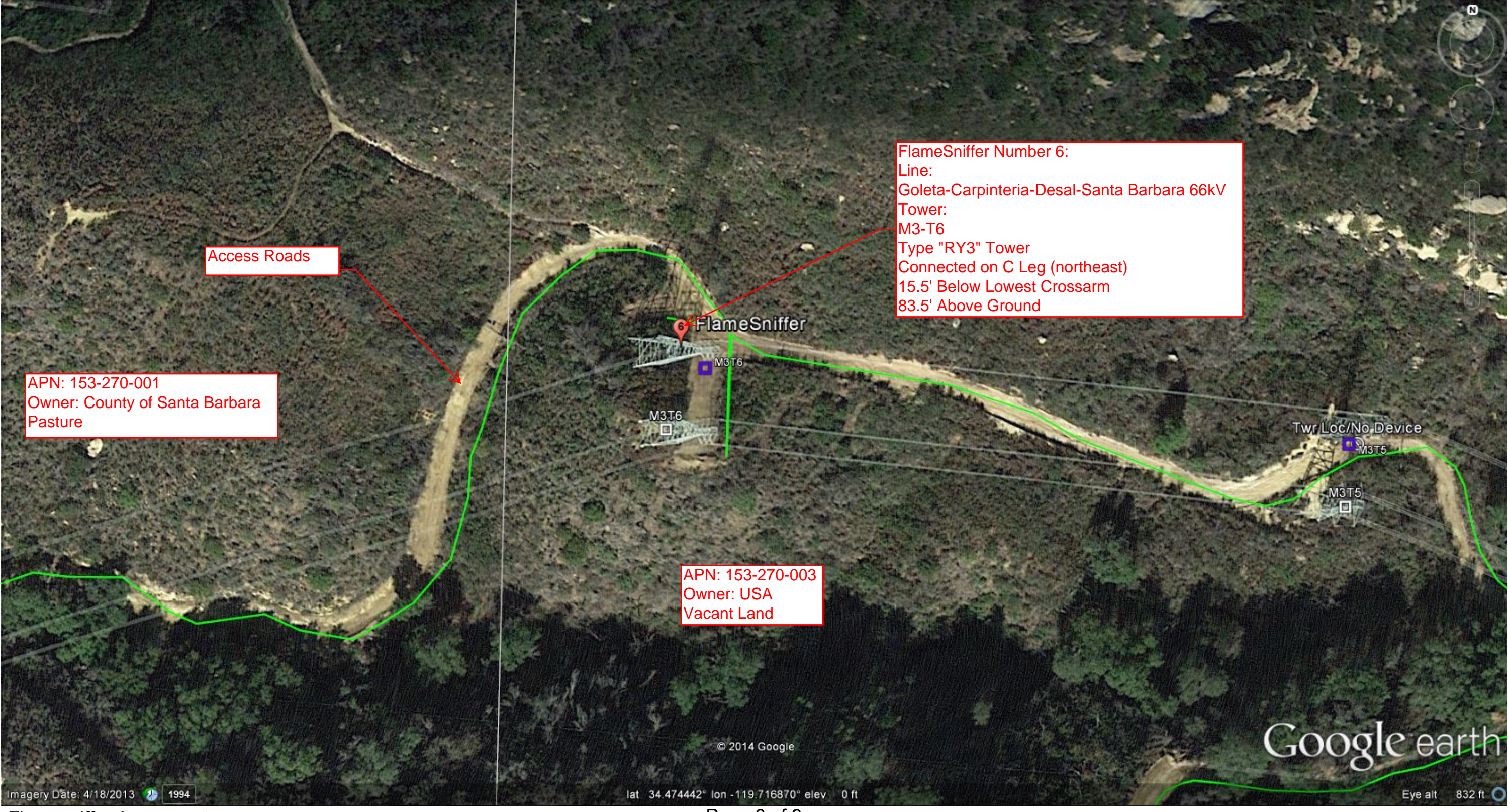
Page 6 of 9