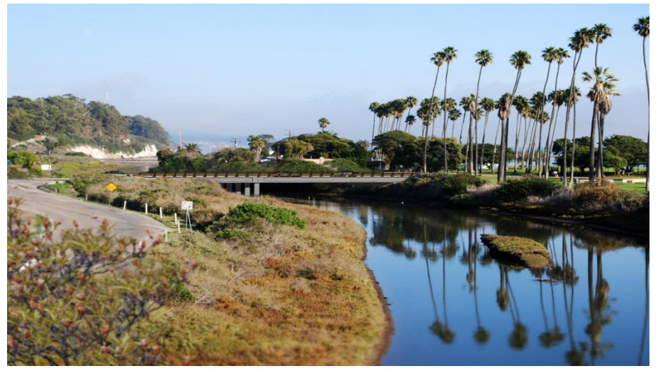
Rendering of proposed Bridge 51C-0358

The new bridge will be an approximately 168-foot long, two-span cast in place concrete box girder bridge. The width accommodates two 12-foot traffic lanes, two four-foot shoulders, a 12-foot-wide Class 1 bicycle path adjacent to but separate from the northbound traffic, and a five-foot wide raised pedestrian walkway adjacent to the Class 1 bicycle path. It would be supported at each end (north and south bank of the Slough) by abutments founded on three to four-foot diameter, 75 to 100-foot deep cast in drilled hole (CIDH) piles. Within the Slough there would only be one supporting pier consisting of four, three foot diameter CIDH piles that will extend into the earth approximately 75 to 120 feet. The supporting pier would be located on the north bank of the Slough, outside of the normal wetted perimeter of the channel.