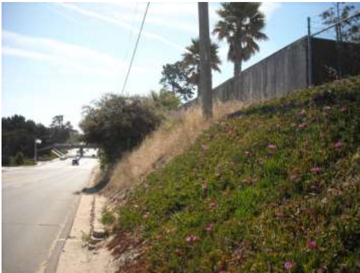
Before- Clark Avenue, looking east towards State Route 135

CCO No. 1 was executed to reinstall advance traffic loops that were cut in order to excavate existing pavement for new sidewalk and curb and gutter construction at a cost of $5,200.00. CCO 2 compensated the contractor for modifying the retaining wall footing excavation method to avoid damage to an unforeseen metal pipe that ran parallel and adjacent to the new footing. The cost for this was $1,019.27. This change order also activated Supplemental Item, Maintain Traffic, for a total cost of $710.20. CCO 3 was comprised as follows: Item 4, Relocate Object Marker, was deleted for a savings to the County of $100.00; a payment adjustment was made for the Asphalt Price Index Fluctuation in the amount of -$7.98; jute mesh slope protection was added behind the retaining wall, at a cost of $658.94. This CCO also added 11 contract working days to the project, due to the fact that the skateboard deterrents were on back order from the supplier.