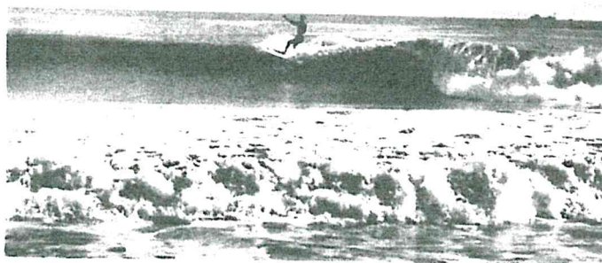
Richard Roche cuts back into a clean green wall at EL CAPITAN point.

CAT CANYON (EDWARDS RANCH) —Right-slide point takes west swell. Rocks protrude above water level in middle of break when surf is 3 feet; at this size short slow rides are available inside. Larger surf may be faster and rides quite long. Point is located 2 miles east of El Capitan in front of private land marked with anti-trespassing signs.